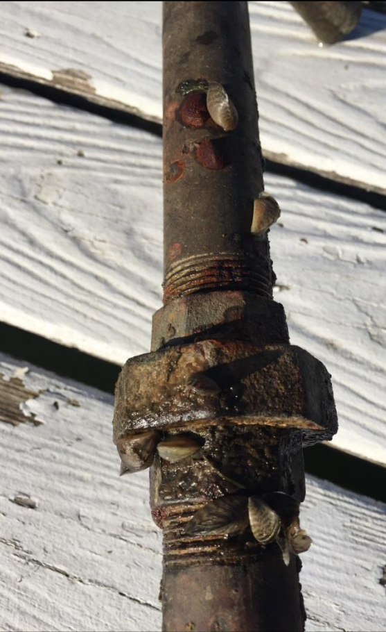
Near Tonyawatha Trail

Lake Monona Sailing Club: large numbers of mussels on piers at about 21 shore stations. Clean Lakes Alliance citizen monitors: 3 locations.