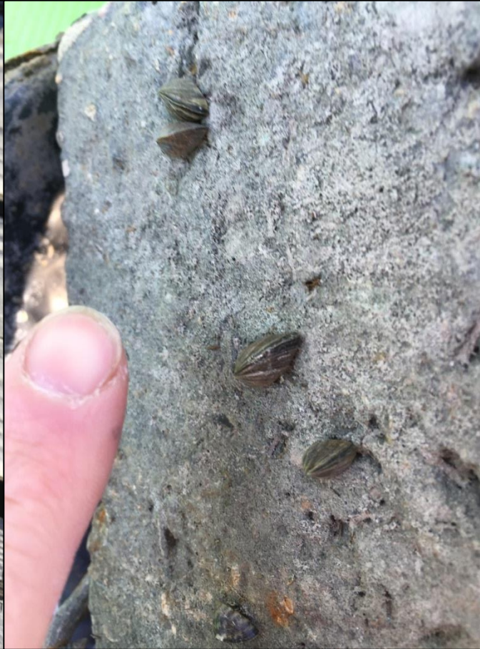
Buoy anchor at Stonebridge Park