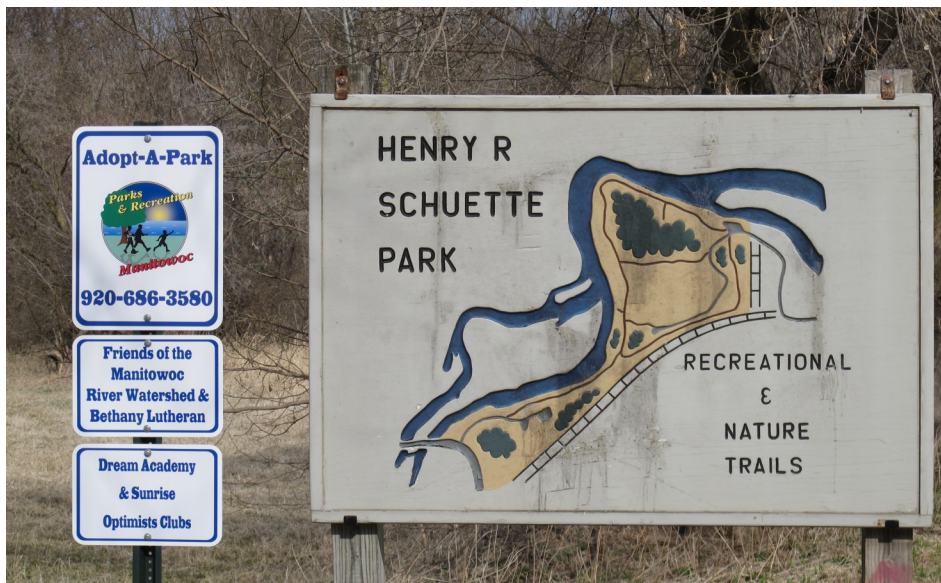
Lower Schuette Park sign, with the parks adopters.

Concerns - Graffiti and vandalism are prevalent in the park and there are no rest room facilities in the lower portion of the park.