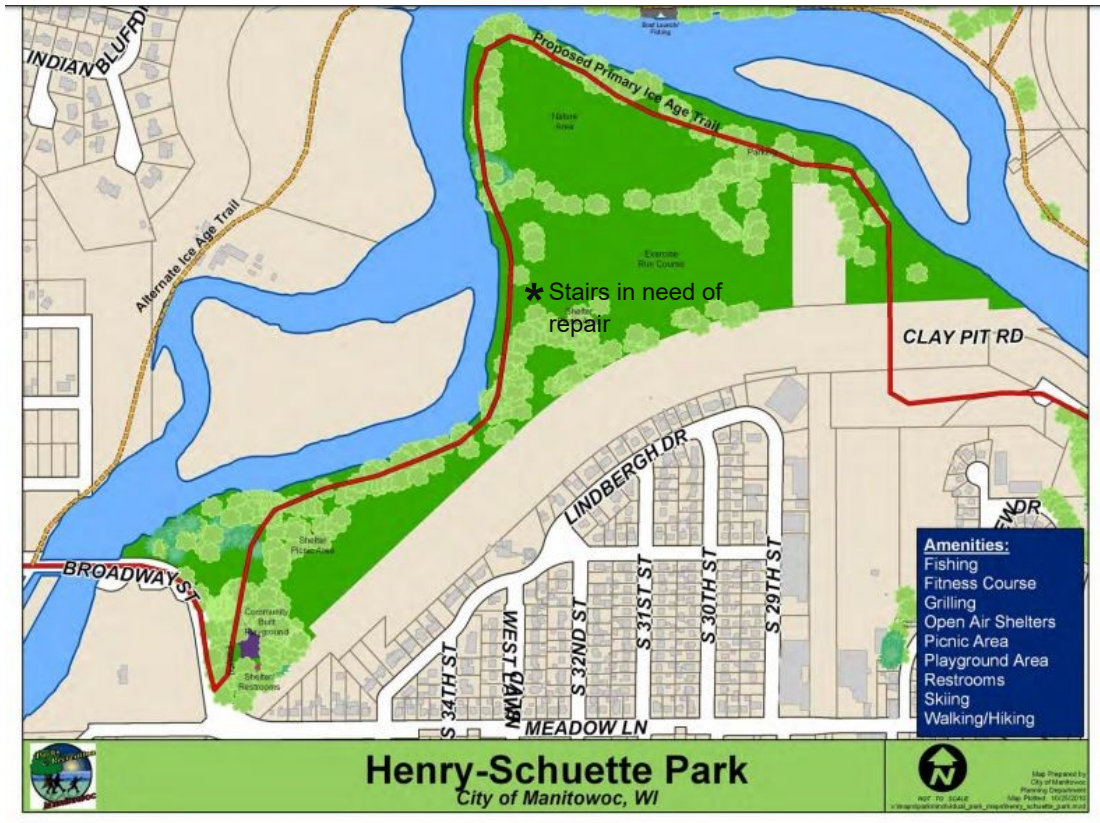
Map of Henry Schuetz Park. (source: City of Manitowoc Webpage).