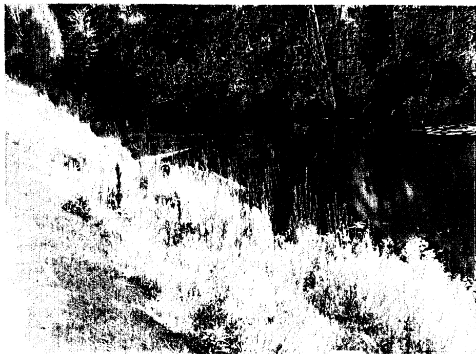
Purple Loosestrife at 6-mile Creek on August 31, 2006

File: 06-09-08 RAL FLLW 2006 Loosestrife Inv.doc