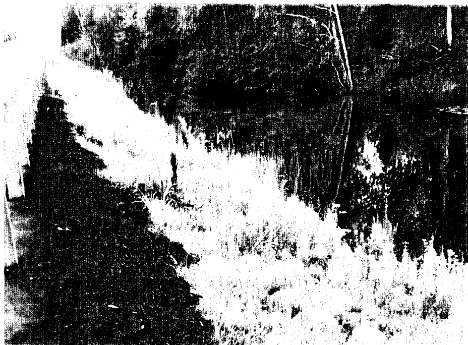
Purple Loosestrife at 6-mile Creek on July 20, 2006