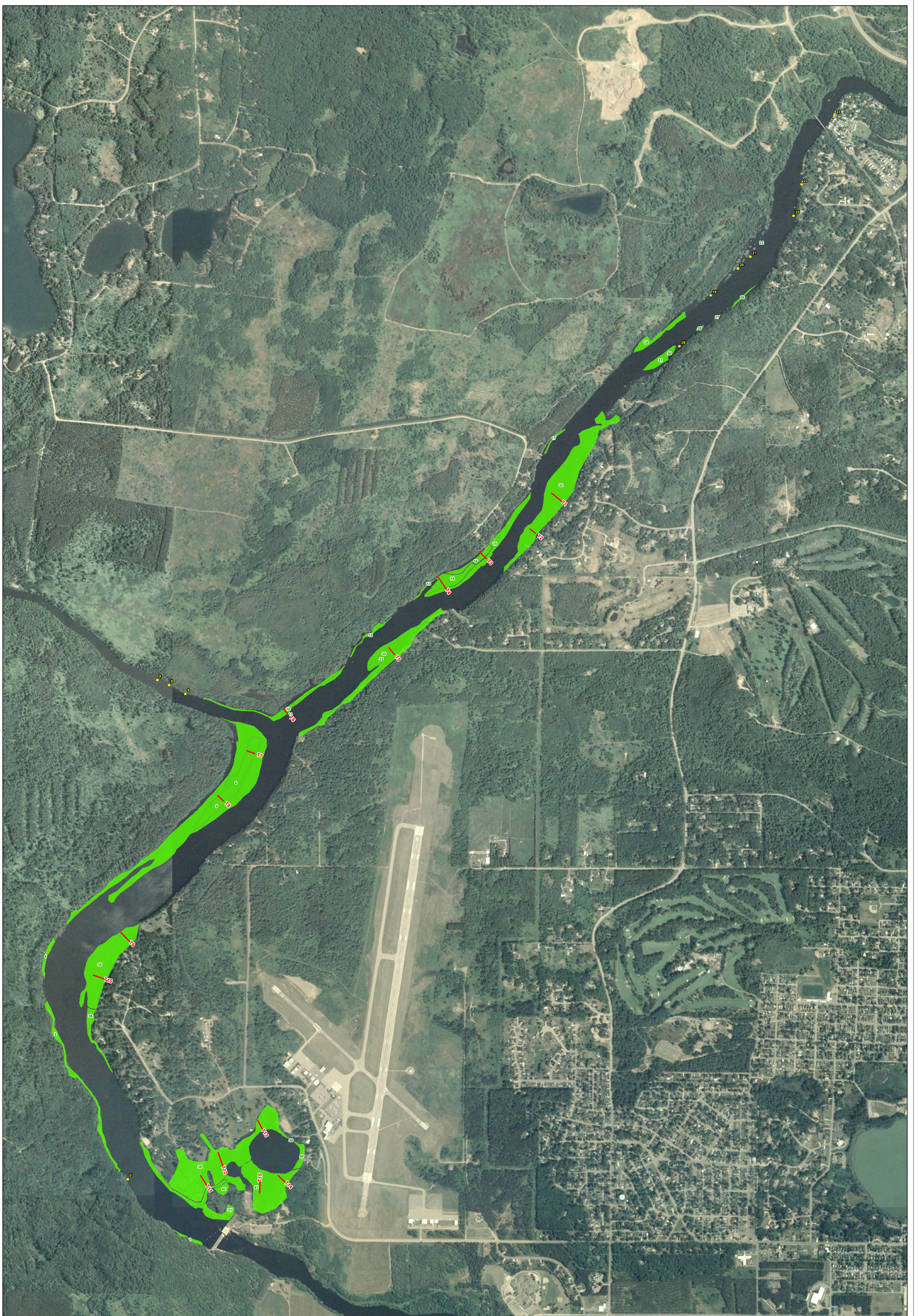
Figure 2-02. WE Energies KingsfordHydro Project. 2008 & 2010 Weevil Distribution Survey.