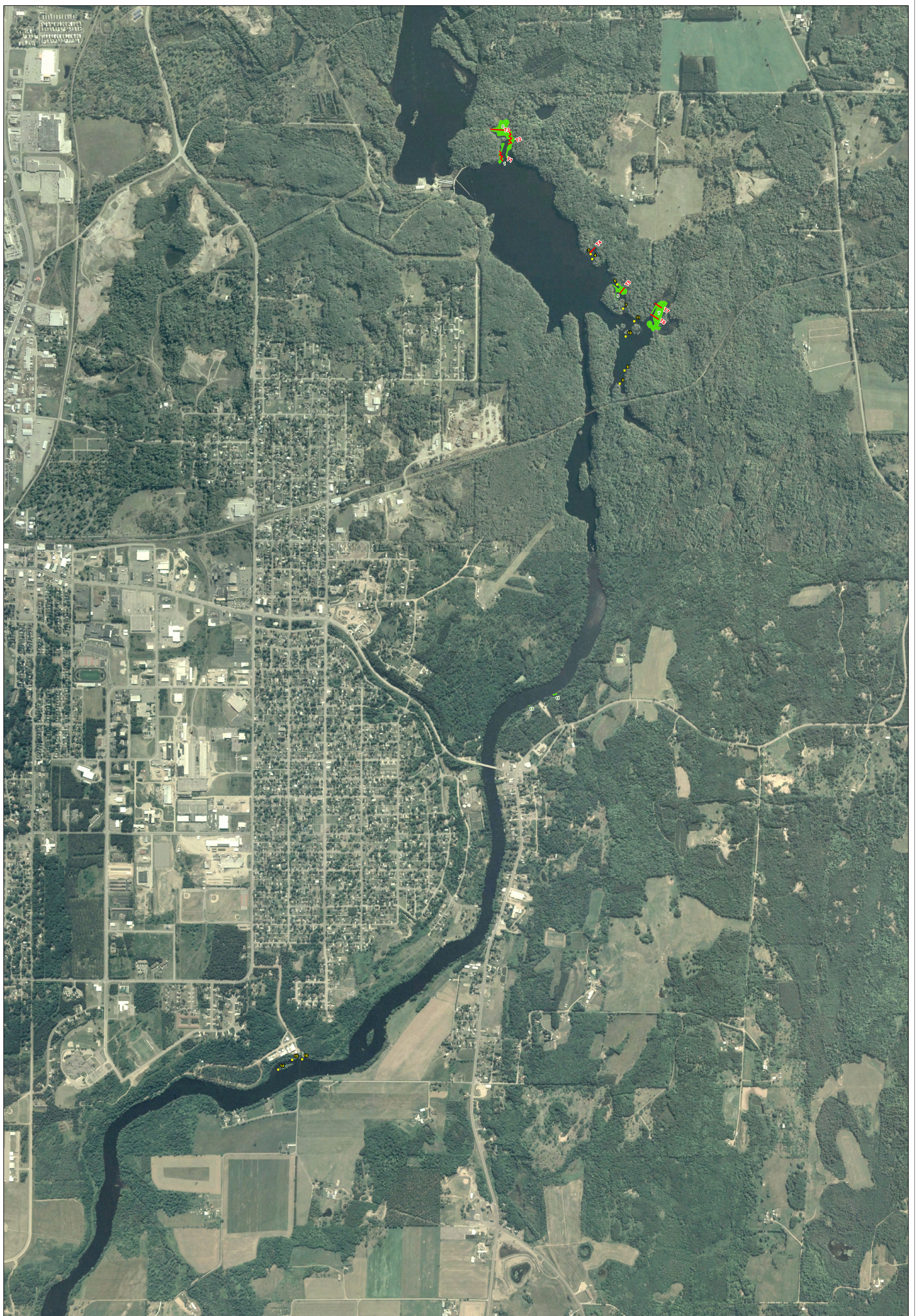
Figure 1-1. WE Energies Big Quinnesec Hydro Project. 2008, 2009, & 2010 Weevil Distribution Survey.