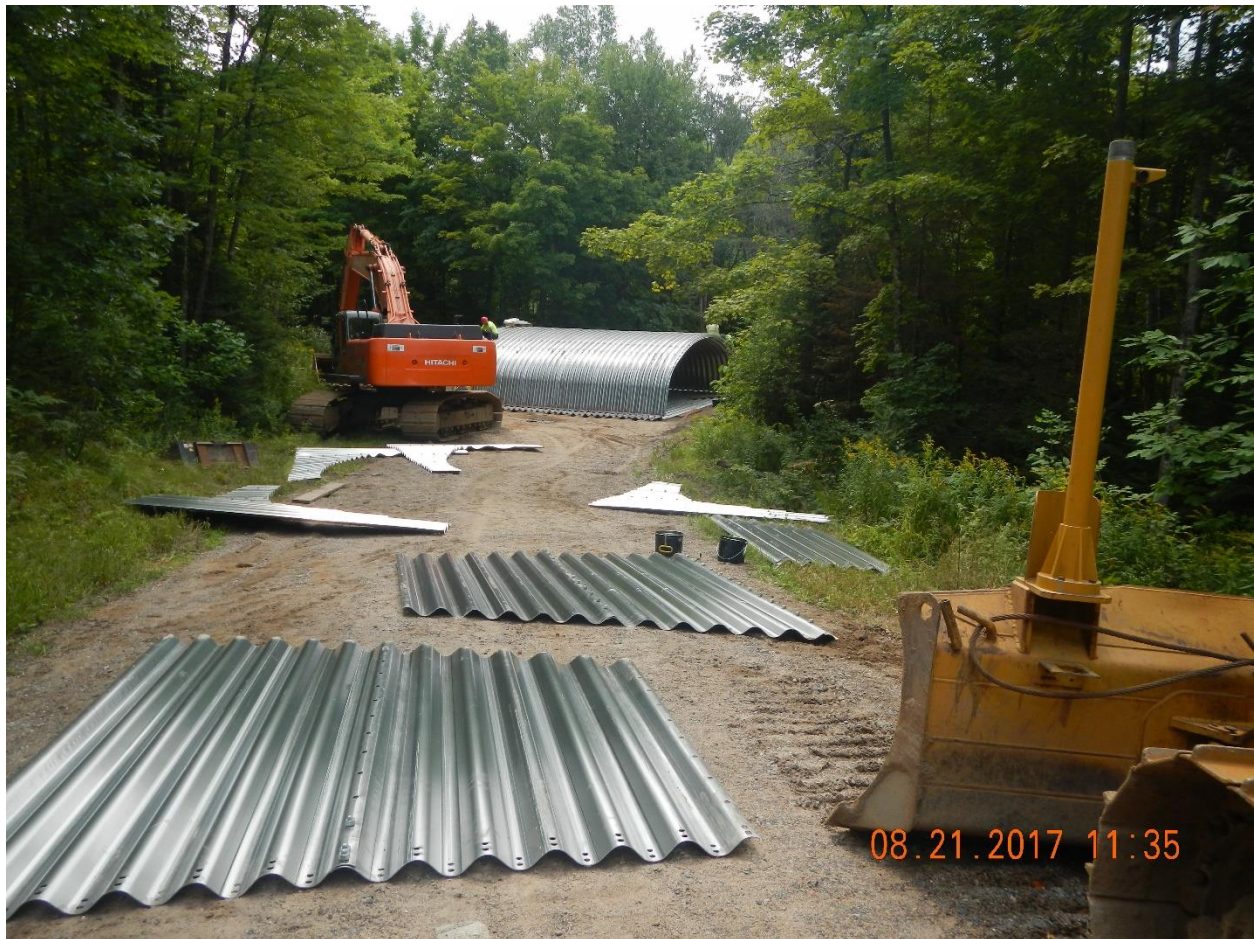
In late August, Stibbe Excavating replaced four 36" round culverts with a 27' 10" wide by 7' 9" tall aluminum box culvert with headwalls and wingwalls. Aluminum box culvert being assembled.

The Hunting River at Fitzgerald Dam Road has been identified as a high priority fish passage barrier for many years. It is a pleasure to report that after many years of cooperative efforts between the Town of Elcho, Langlade County Land Conservation Department (LCD), Department of Agriculture Trade & Consumer Protection (DATCP), Department of Natural Resources (DNR), and Trout Unlimited (TU), aquatic connectivity of the Hunting River System has been restored. This resulted in significant environmental benefits to the Hunting River and delivered a long-lived, low maintenance, flood resilient road crossing for the Town of Elcho.