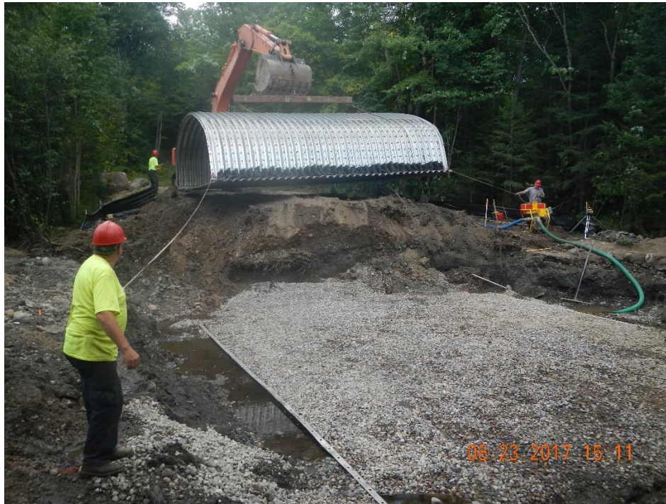
Aluminum box culvert being lifted into place. Hunting River flow was maintained and diverted from the pipe trench using temporary culverts and a bypass channel.