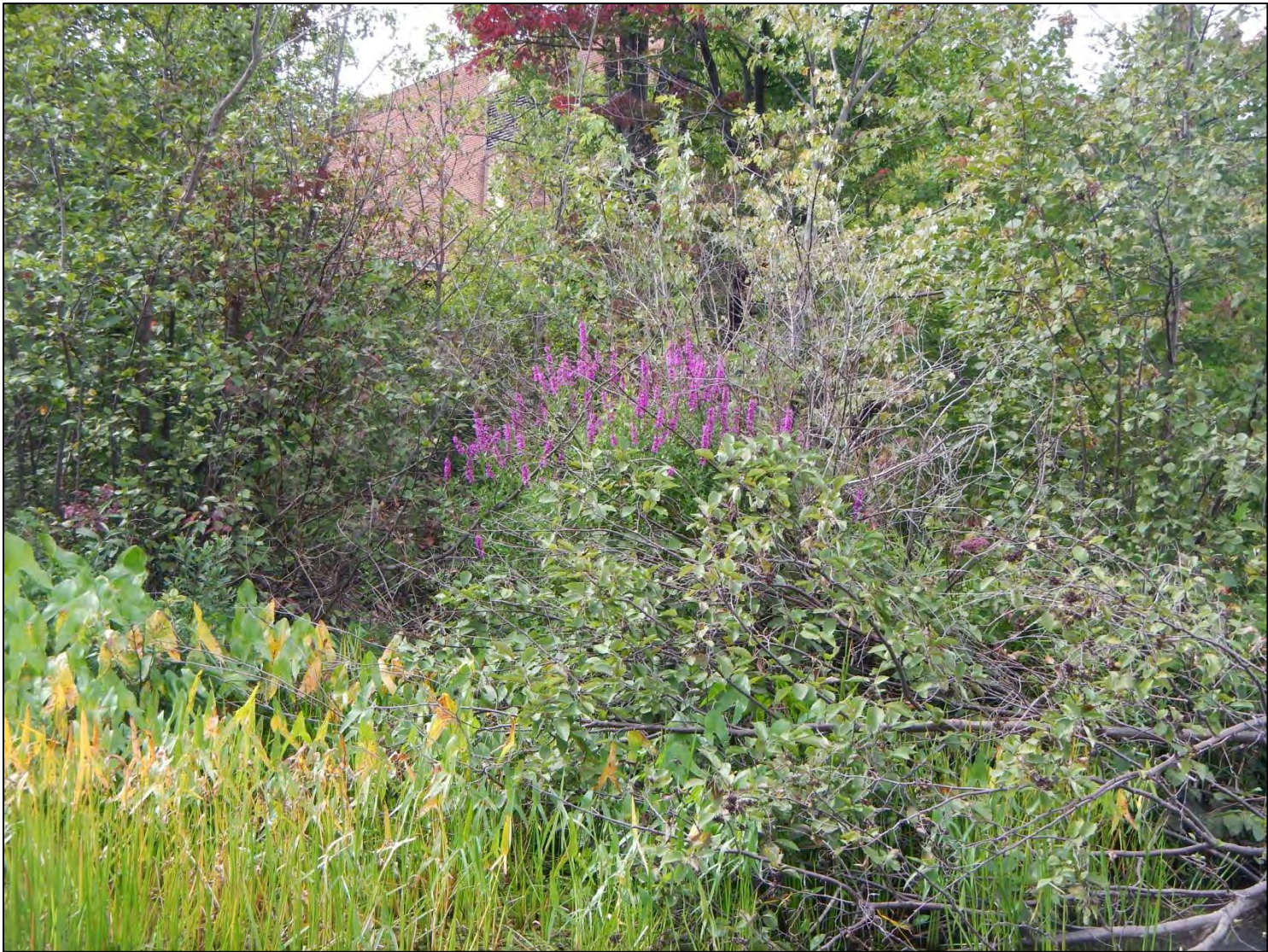
Photo 1. Purple loosestrife growing in wetland area.