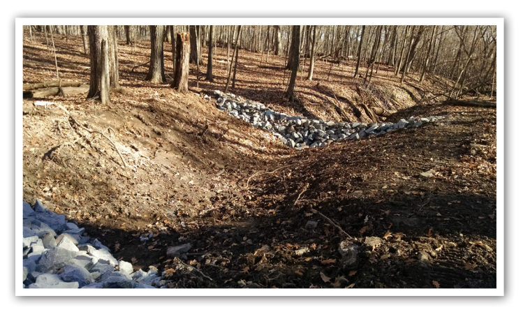
Rock check dams, below the culvert on the opposite side of the driveway, further slow the water preventing erosion in streams that flow to Deer Lake.