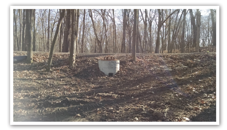
The riser pipe shown above holds back runoff water creating a temporary ponding area above the driveway.

With permission of the former owner and adjacent property owners, measures were installed in the fall of 2016 to slow water flow from ponds on the eastern edge of the Johnson Preserve which receive agricultural runoff from north of 140th Avenue. The resulting ponding area allows runoff water to settle and release slowly to reduce significant erosion along an intermittent stream channel which flows to Dry Creek then directly to Deer Lake. A Wisconsin Department of Natural Resources grant paid 75% of the cost of this installation.