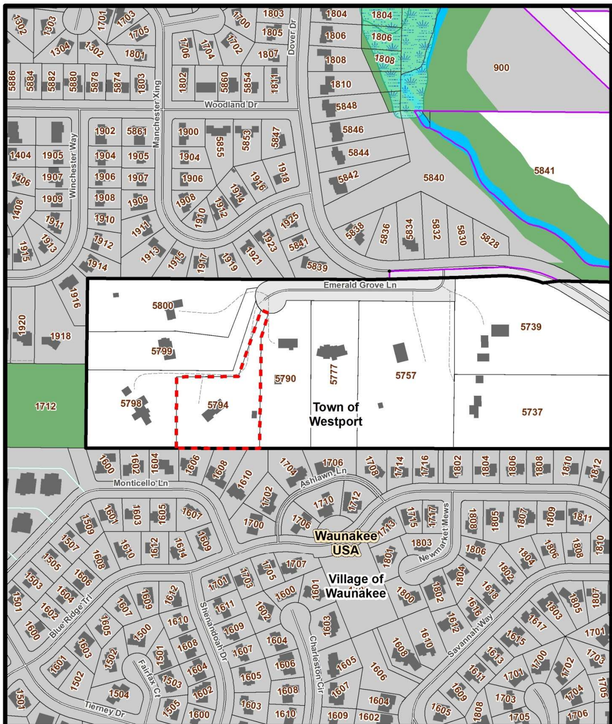
Map 1 Amendment Area

Proposed Amendment to the Dane County Water Quality Plan, Revising the Sewer Service Area Boundary in the Waunakee Urban Service Area