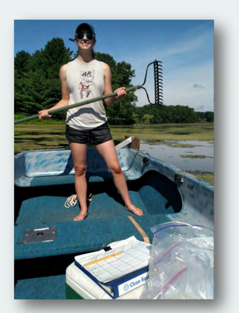
Jasmine, a Golden Sands LTE, performing PI Surveys

2016. Approximately twenty plants were observed along the northwestern shore adjacent to HWY Y. All the observed plants are in less than six feet of water and a hand removal is being planned to eradicate the found plants. Mission and Mud Lake's PIs will be conducted within a few weeks.