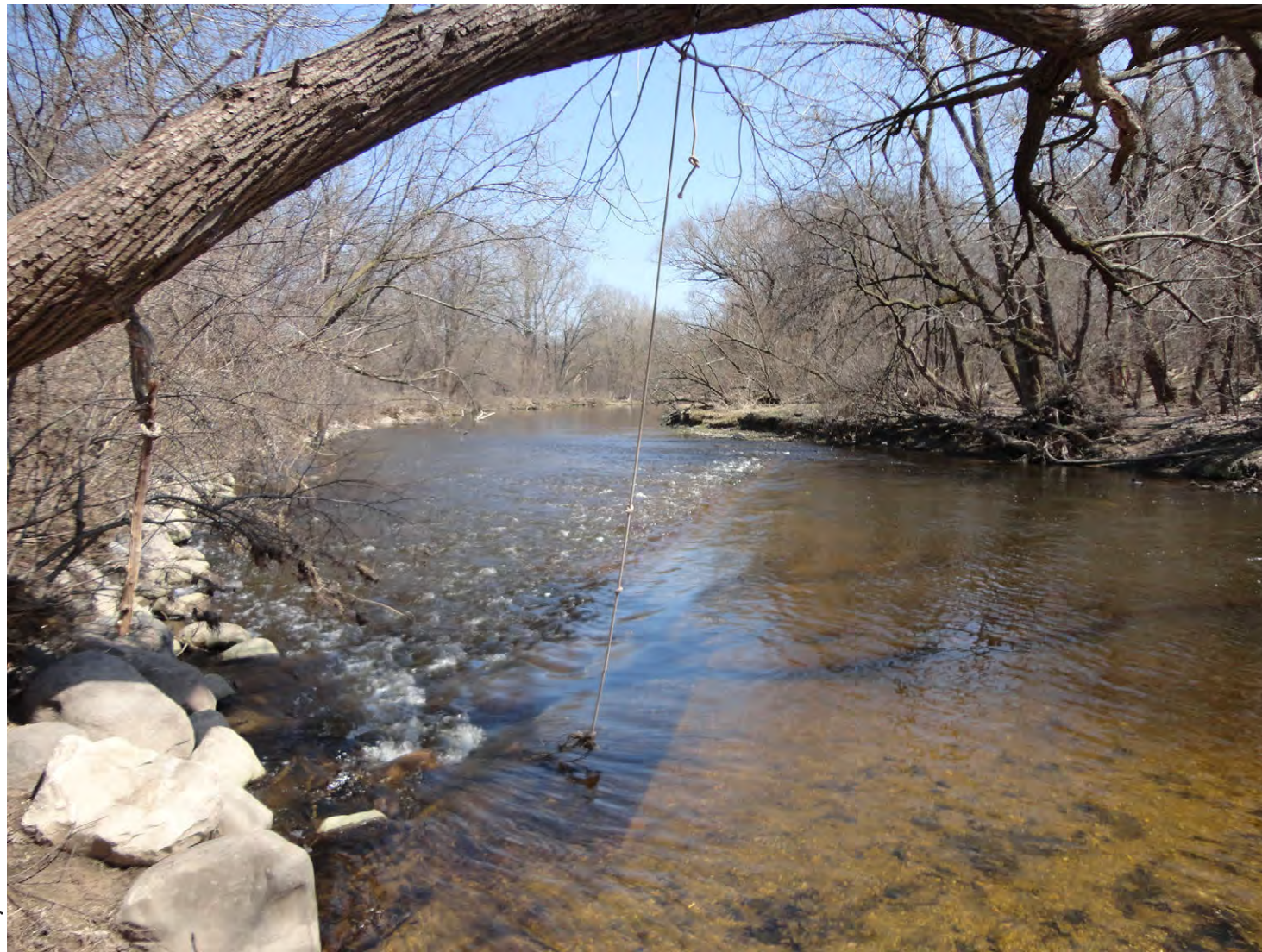
Looking downstream from left bank