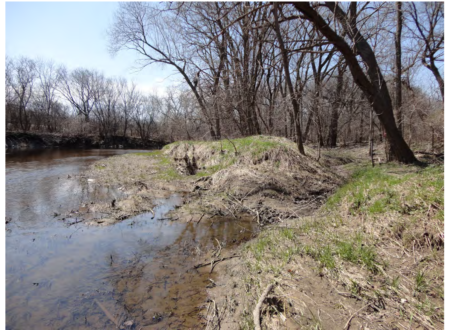
Looking upstream from left bank at backwater channel