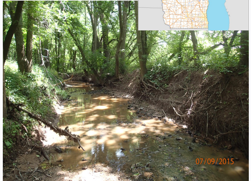
Unnamed tributary to Kankapot Creek at CTH KK.

In 2015, monthly chemistry samples were collected by citizen volunteers May to October. Habitat, fish and macroinvertebrates surveys were conducted by Wisconsin DNR at watershed sites to assess the physical and biological conditions of streams in the watershed along with the chemistry data.