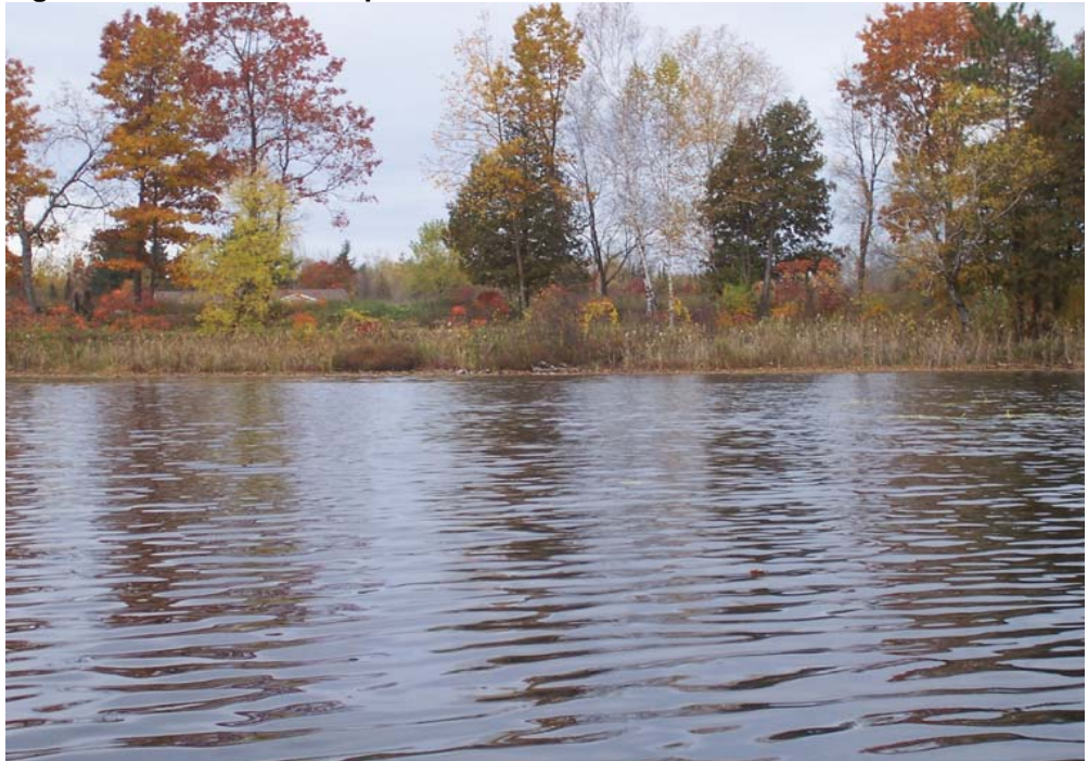
Figure 6. South section of CRHA 2 with natural shoreline