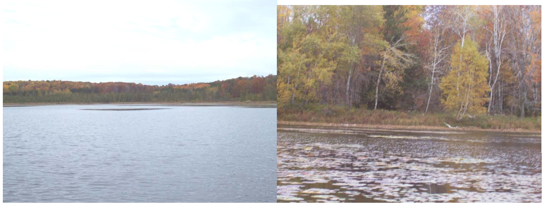
Figure 3. Overview of Jacqueline Lake CRHA 1 and close up of wooded shore at CRHA1.