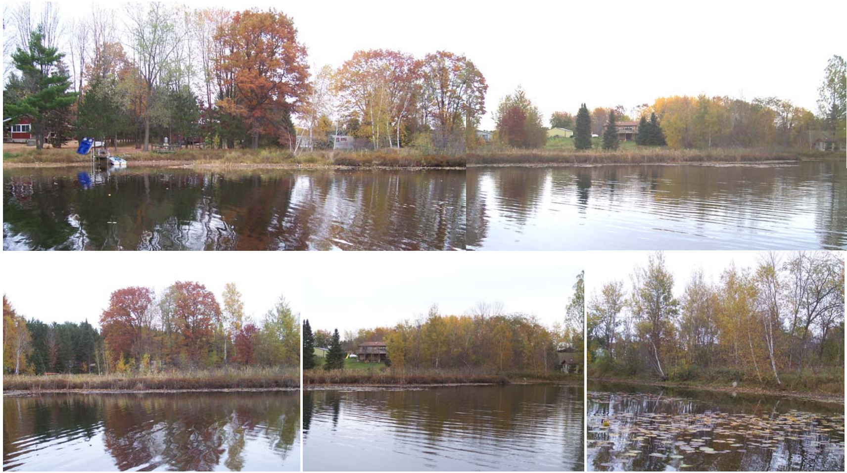
Figure 7. Jacqueline Lake CRHA 3; top overview; bottom views of bog island with shoreline behind and view in channel between bog island and shore.