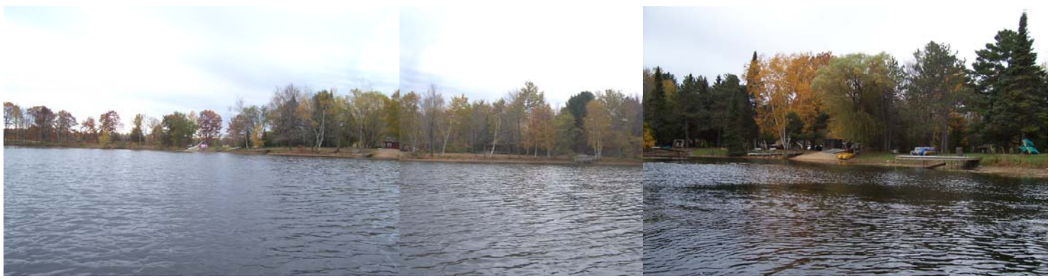
Figure 5. Overview of Jacqueline Lake CRHA 2