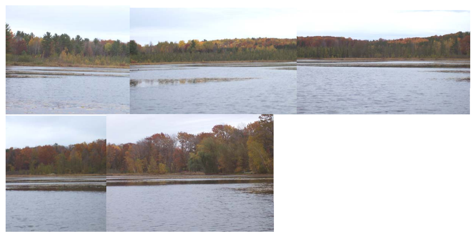
Figure 4. Jacqueline Lake CRHA 1, north shore, west to east