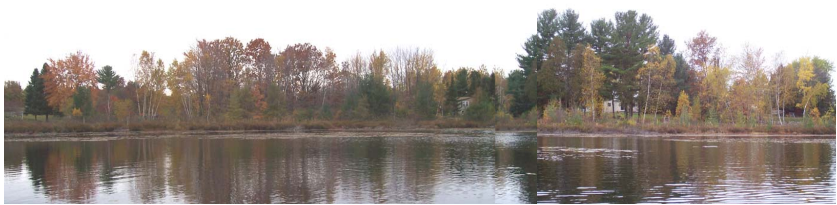
Figure 8. Jacqueline Lake CRHA 4, view of bog island and shoreline behind