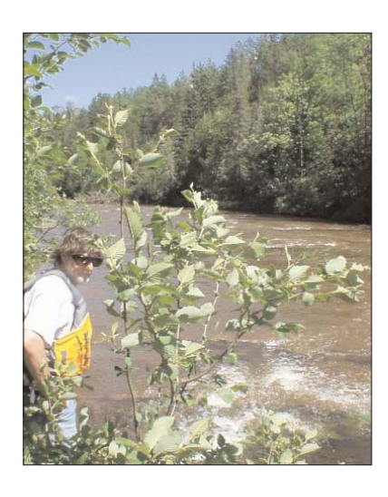
White River Citizen Involvement Committee