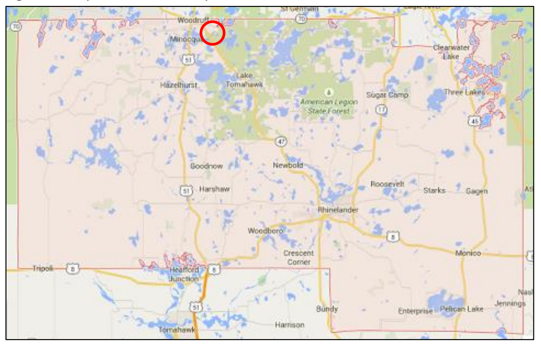
Figure 1. Map of Oneida County, WI with Carrol Lake circled in red.

Figure 2. AIS Boat Launch and Shoreline Surveillance Monitoring Location.