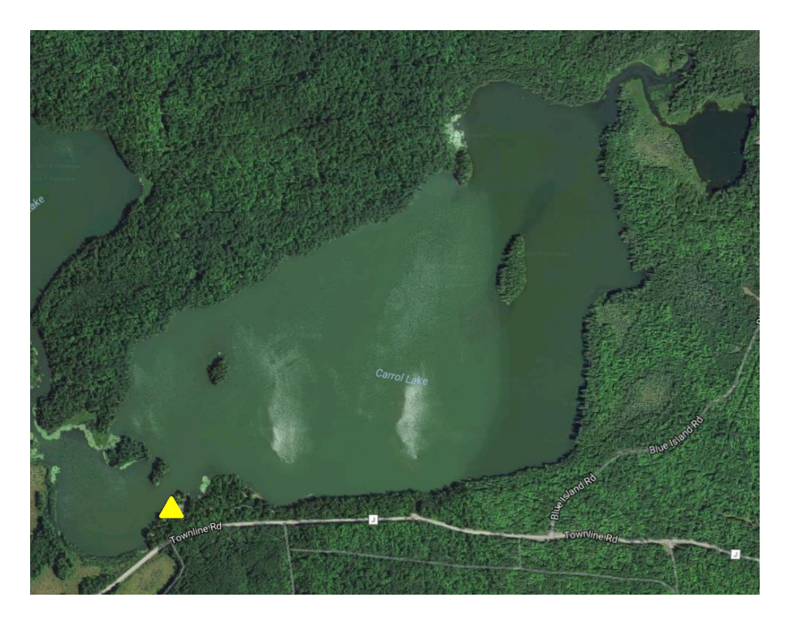
Figure 1. Map of Carrol Lake with the public boat landing represented by a yellow triangle.