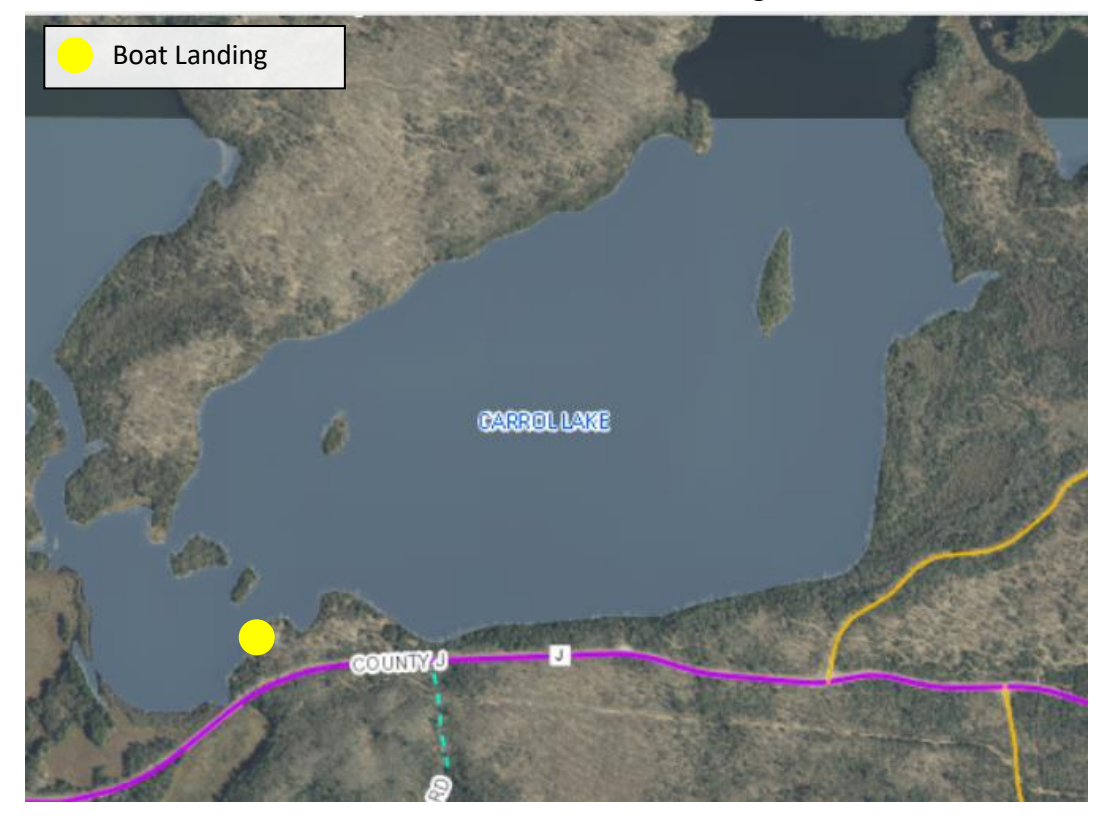
Figure 2. AIS Boat Launch and Shoreline Surveillance Monitoring Location.

Resources: <a href="https://dnr.wi.gov/lakes/LakePages/LakeDetail.aspx?wbic=1544800">https://dnr.wi.gov/lakes/LakePages/LakeDetail.aspx?wbic=1544800</a>