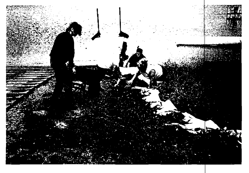
Figure 3. Examples of three shoreland management options.

3. Restoration: This involves removing existing vegetation through the use of paper mats and/or mulching and planting a variety of native grasses, flowers, and shrubs into the shoreland area.