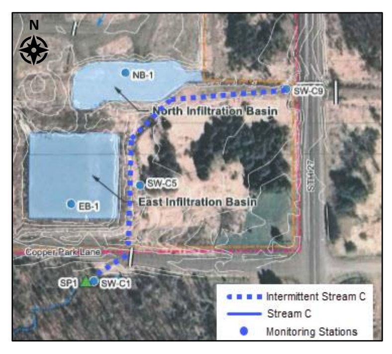
Figure 1. Map of the upstream portion of Stream C. North of Copper Park Lane the stream is intermittent. Samples were collected on days when water flowed. Map adapted from Flambeau Mining Company report.

This assessment shows high levels of copper, consistently exceeding criteria (Figure 2), and zinc exceeding twice in 2018 (Figure 3), in the upstream portion of Stream C (SW-C9). With this new information the upstream reach of Stream C is proposed for placement on the state's Impaired Waters List for zinc and copper causing acute aquatic toxicity.