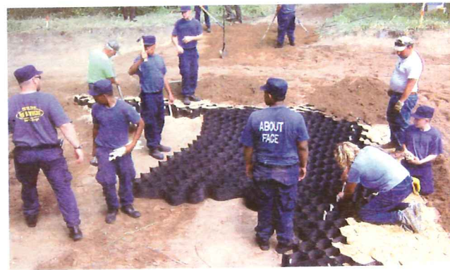
Created & Printed at Navarino Nature Center - 2008