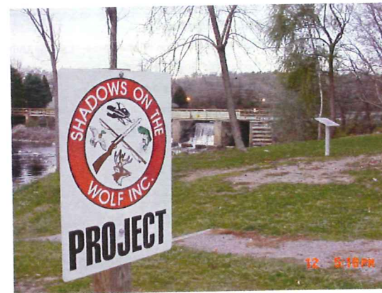
Shadows on the Wolf project at the Shawano Dam.