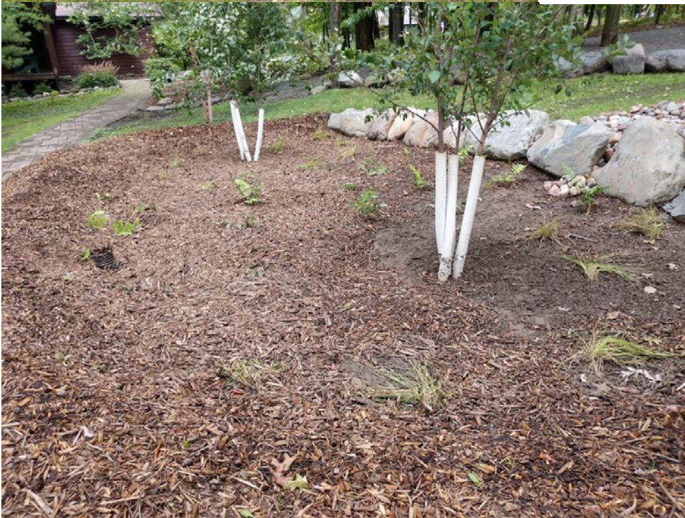
Gartland - Rain Garden #4