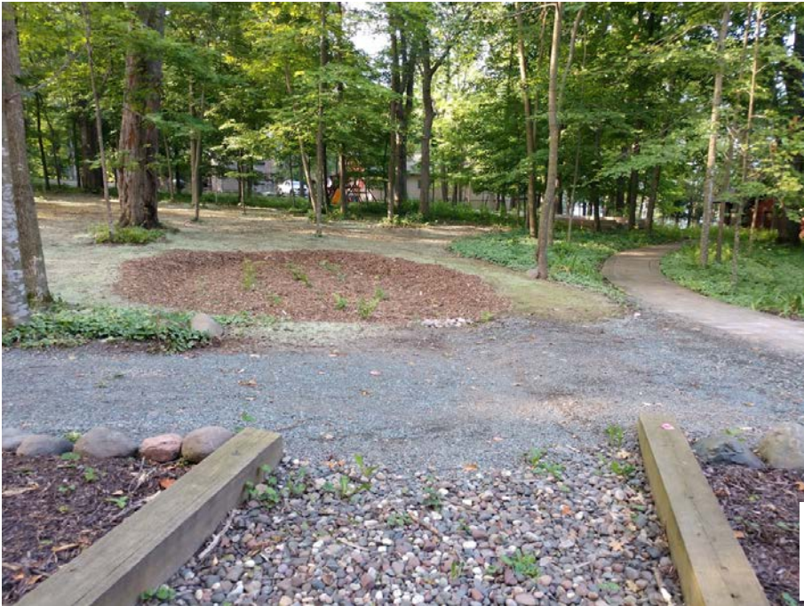
Gartland RG2 After: 08/17/2022