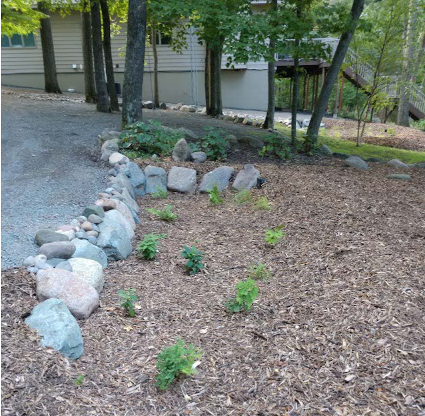
Gartland - Rain Garden #3