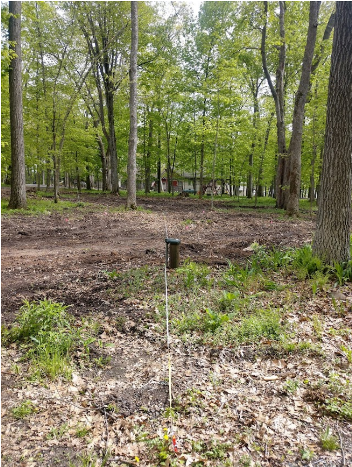
Gartland RG1 Before: 5/26/2022