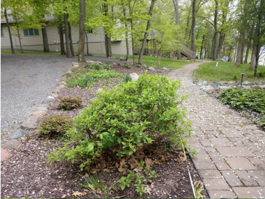
Gartland - Rain Garden #3