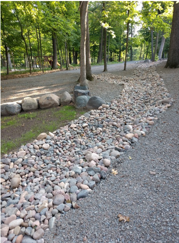
Gartland Diversion After: 8/17/2022