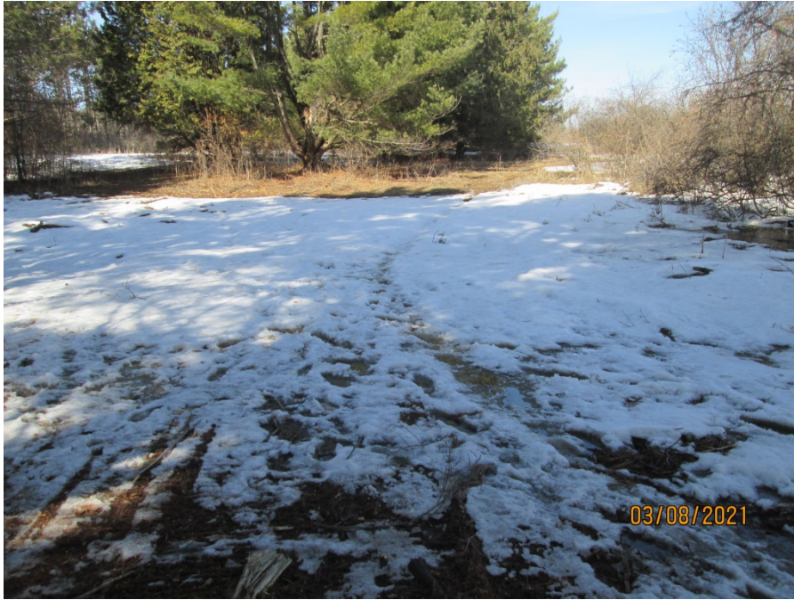
Basin 1 Before: March 2021