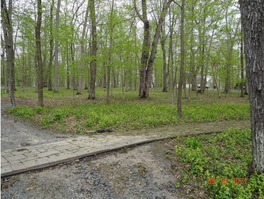
Gartland RG2 Before: 5/18/2021