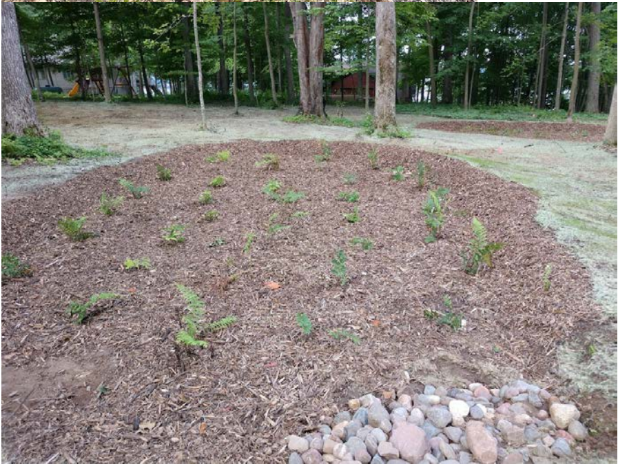
Gartland RG1 After: 8/17/2022