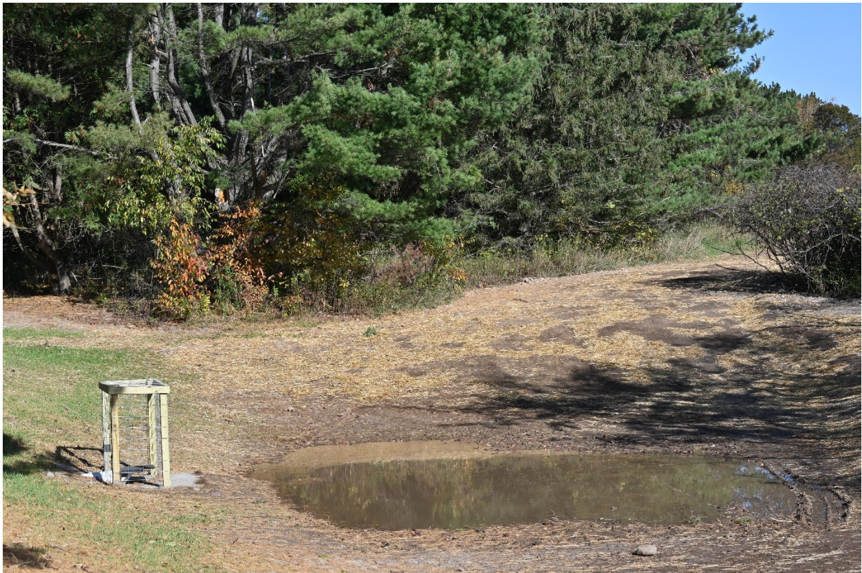
Basin 1 After: 10/17/2022