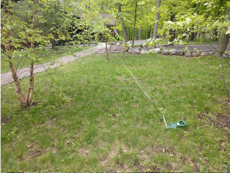
Gartland - Rain Garden #4