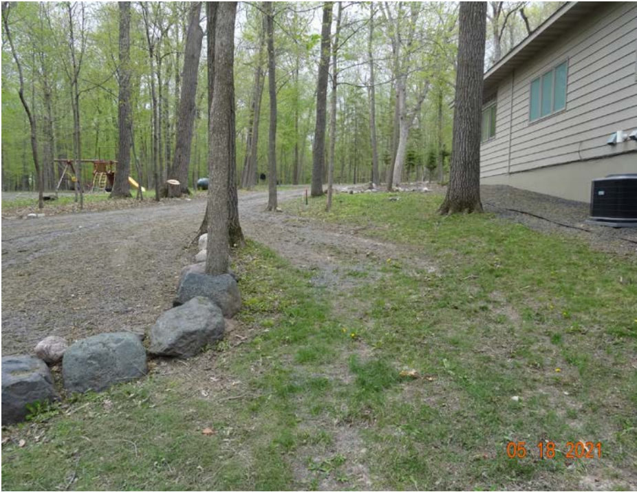
Gartland Diversion Before 5/18/2021