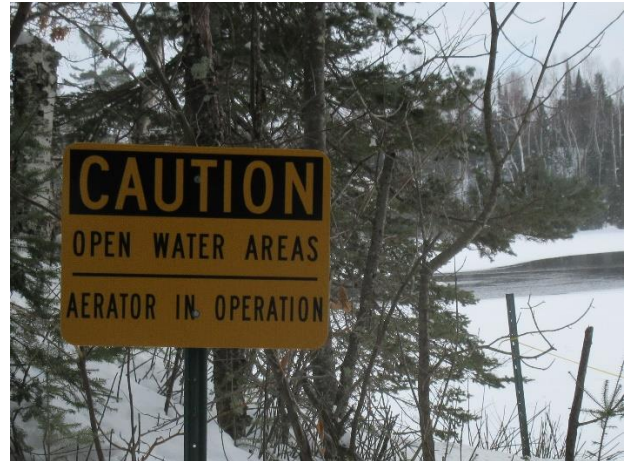
Open Water Caution Sign Wording