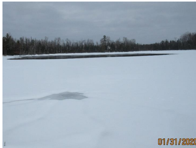
Open Water Area – January 2020