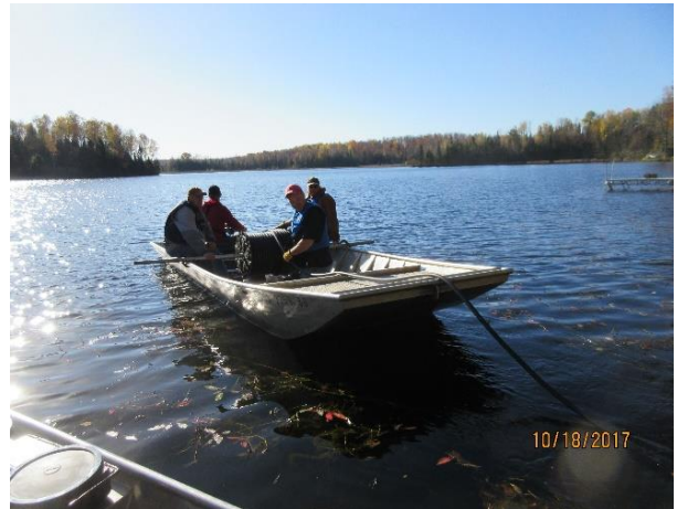
Placement of Airline into Lake