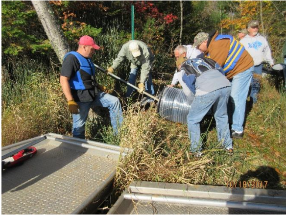
Loading Airline Reels onto WDNR Boats