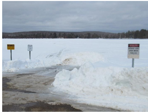
Open Water Caution Signing at Pickerel Lake Boat Landing