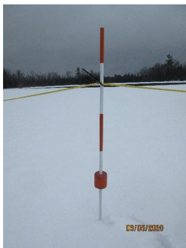
Open Water Fence Post with Reflective Tape on Post and top Float