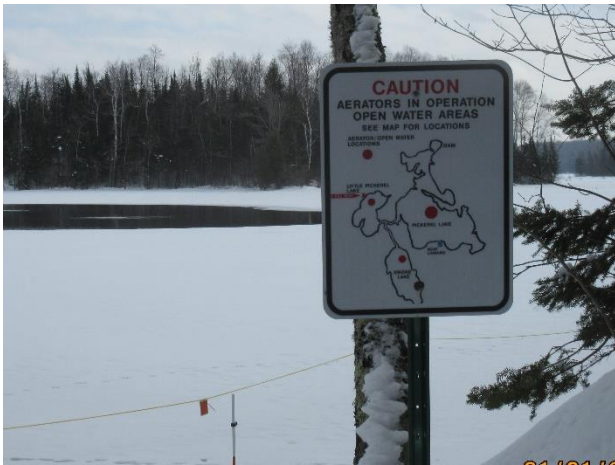
Open Water Caution and Location Sign Wording at Little Pickerel Lake Access