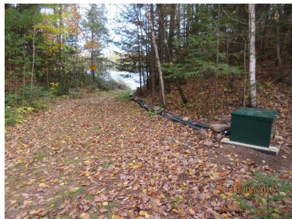
Compressor Cabinet and Airlines to lake