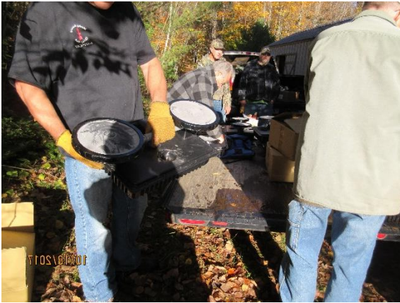
Dual-disk Diffuser unit