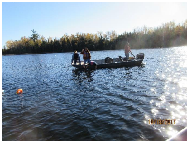
Lowering Diffuser into Position