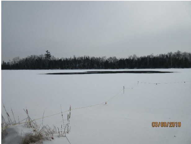
Open Water – March 2018