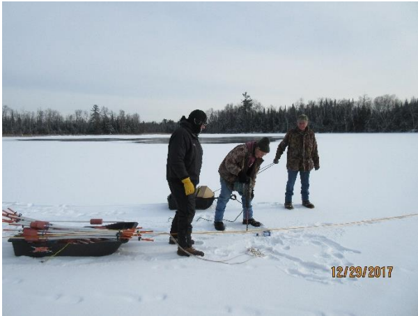
Drilling Holes for Open Water Warning Fence Posts