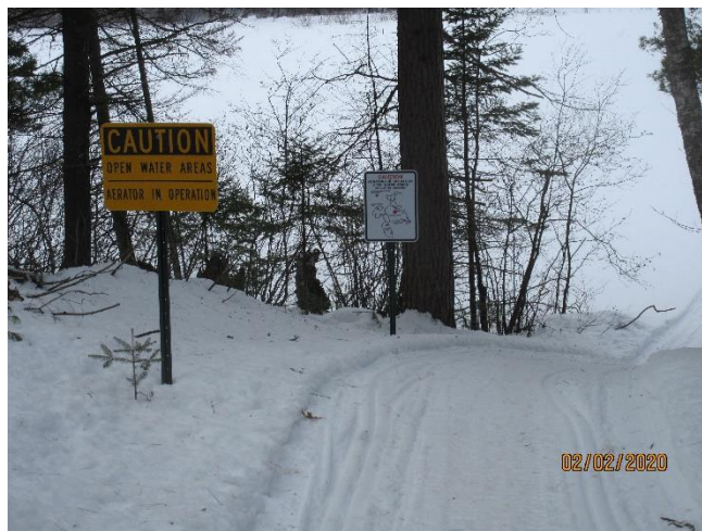
Open Water Caution Signing at Pickerel Lake Snowmobile Access