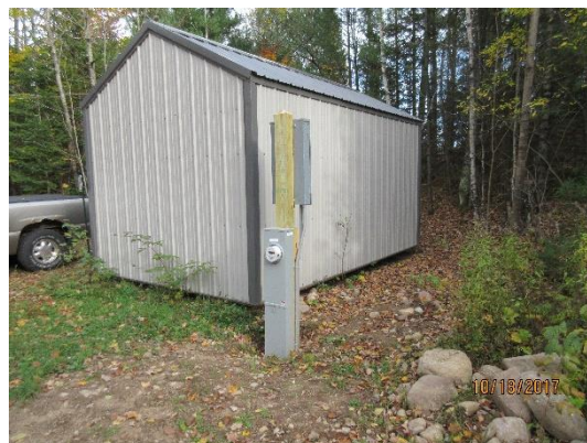
Aerator Electric Service Panel