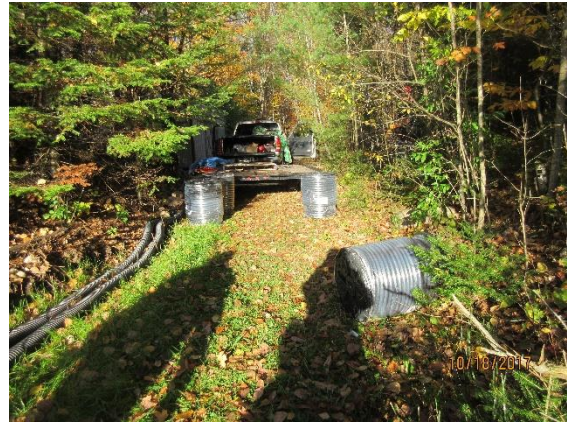
Reels of Weighted Airline