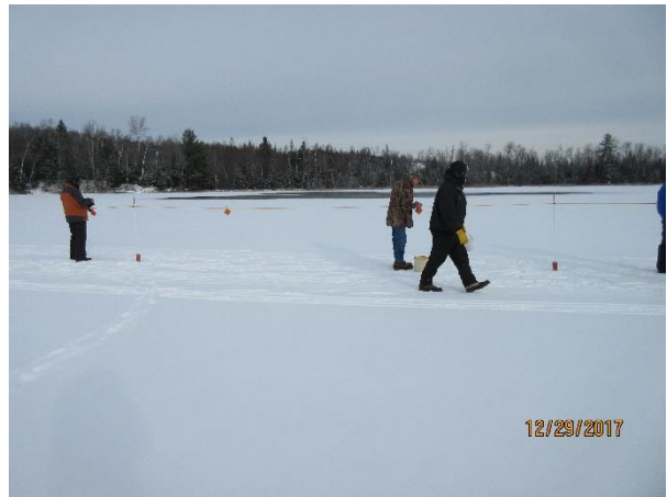
Hanging Open Water Fence Rope and Plates