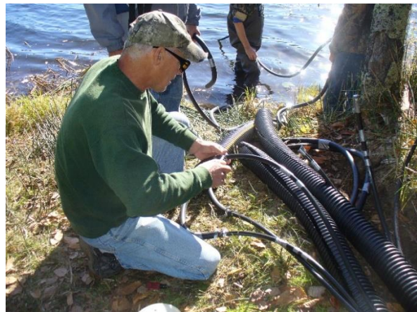
Connecting Weighted Airline in lake to Non-weighted Airline and 4-inch Tile on Shore