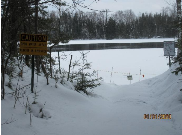
Open Water Caution Signing at Little Pickerel Access