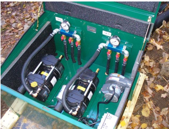
Cabinet with Rocking Piston Compressors