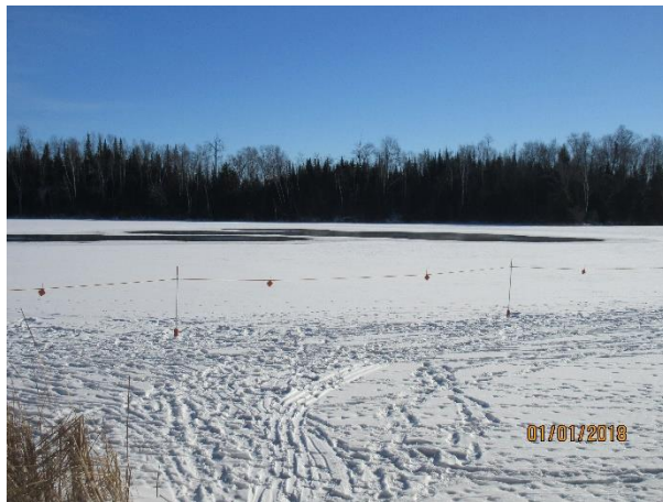
Open Water Fencing System – posts, plates, rope