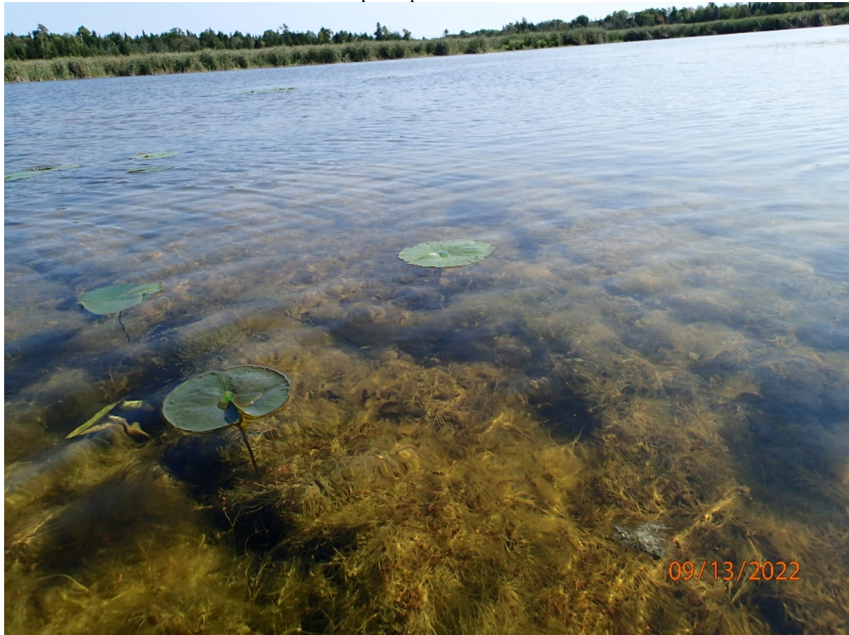
Photo 3. Clear water and abundant native aquatic plants on Dunes Lake.

Water quality monitoring - Chlorophyll a , total phosphorus (TP), Secchi depth, and dissolved oxygen and temperature profile data were collected at the deep spot in Dunes Lake (Station ID: 10029267) in the summer of 2021 and 2022. Trophic status was calculated using chlorophyll data. Note Secchi disc hit bottom during each measurement. Photo 3 from Dunes Lake September 13, 2022 shows clear water and abundant native aquatic plant growth.