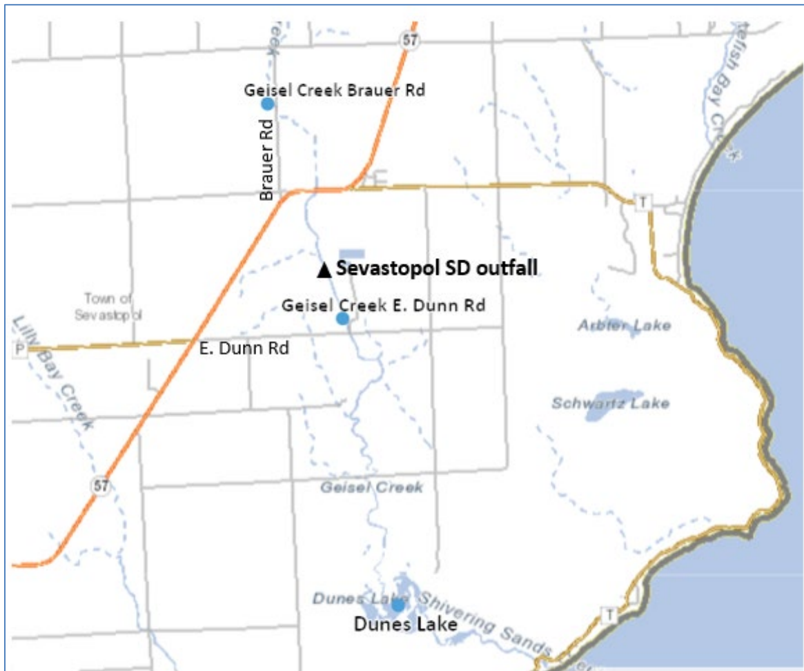
Map 1. Geisel Creek and Dunes Lake monitoring locations.