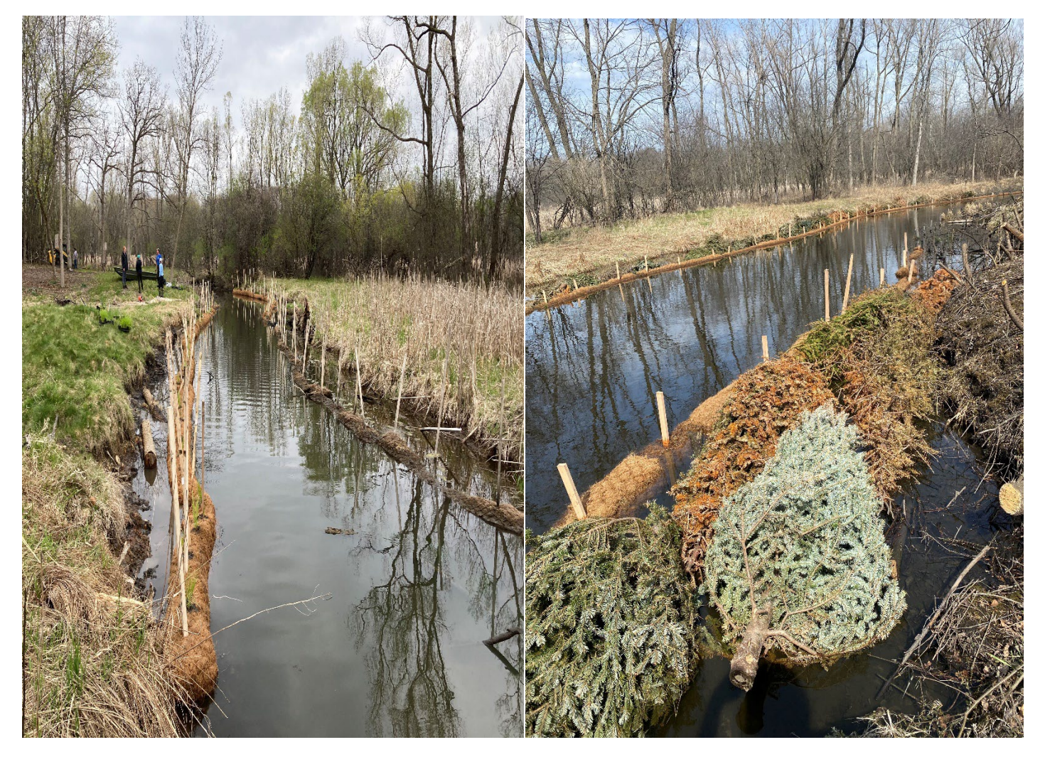
Hundreds of feet of streambank were completed this 2021 and 2022 year (see above photos) and of course every projects hard day's work, should end properly with a cold beverage and a hot hamburger (below).