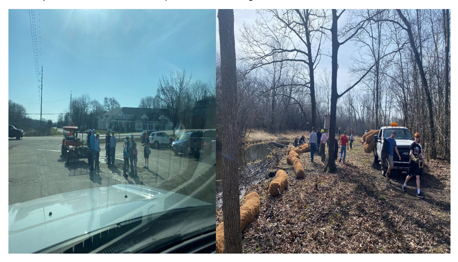
Loading up and staging the materials for placement.