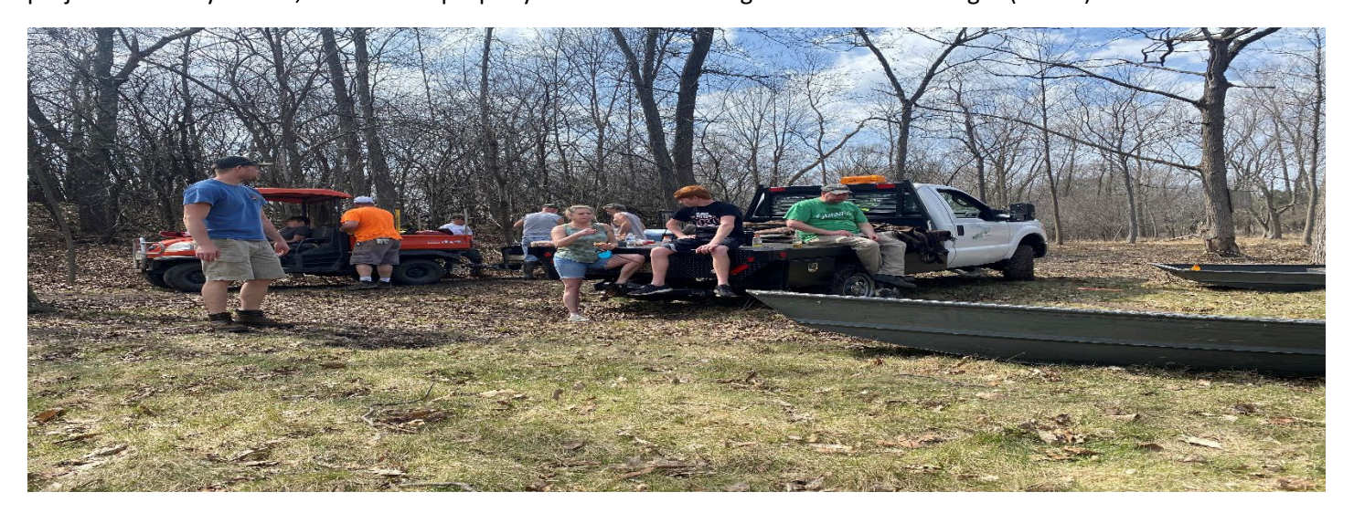
The grant has been extended so more work is anticipated in the Spring of 2023.