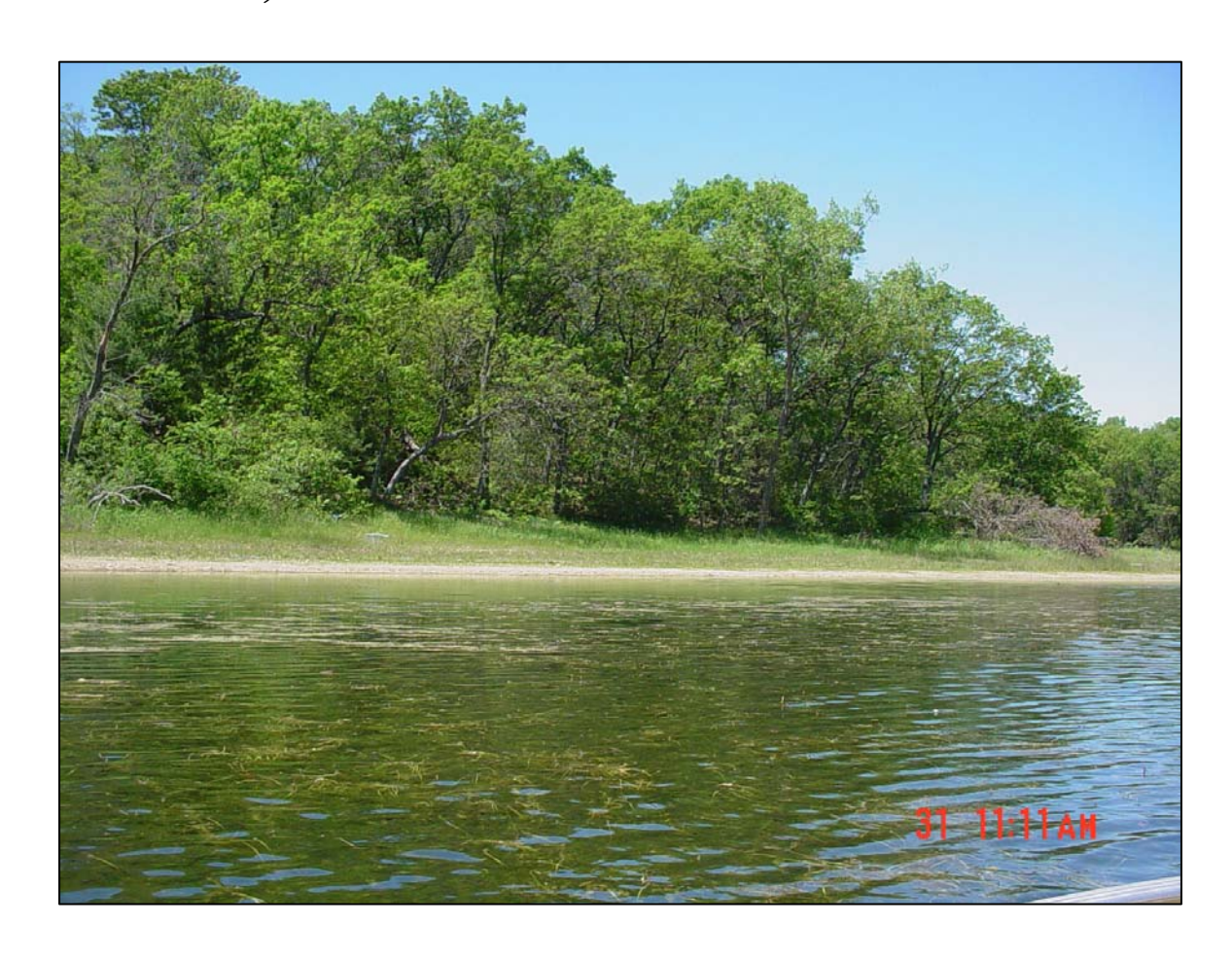
Submitted by Reesa Evans Adams County Land & Water Conservation Department

Wisconsin Department of Natural Resources