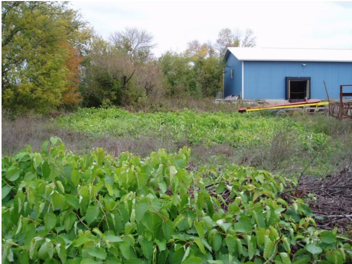
August 28, 2010

The spraying schedule for the site was the same as the Chetek site: September 1, 16, 27, 28 and October 4.