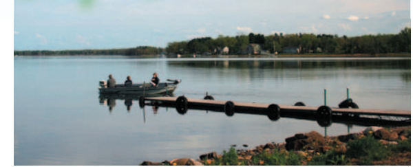
Shell Lake boat Landing