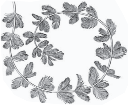
Eurasian water milfoil

Eurasian Water Milfoil (EWM) is just one of several nonnative plants entering many of our lakes. Plants like EWM are most often spread when they "hitchhike" with anglers and boaters carrying small plant fragments from one lake to another. Invading plants can aggressively out-compete native vegetation and become a nuisance for swimming, boating and fishing. Fortunately, there are four simple actions you can take to prevent them from entering lakes.