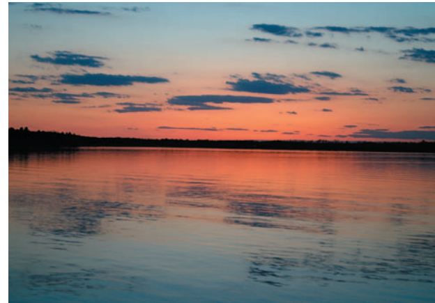
Shell Lake's south bay at sunset