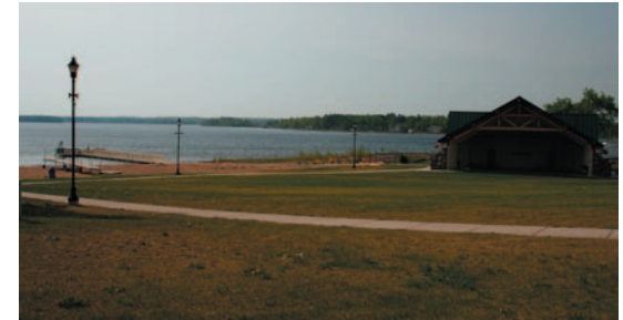
Shell Lake Pavilion with restrooms and universally accessible pier

Thanks for helping protect our lake. Stop aquatic hitchhikers.