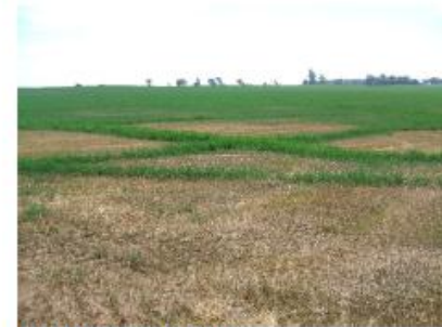
Fracture Traces in Field

A field which is not classifed as an AGMZ means either no features in or near the field pose a threat to groundwater contamination or the field has yet to be checked for karst features. These fields may still be a threat to groundwater contamination (see Morrison Parcels Verified by LWCD map to see which areas have been checked for karst and other conduits to groundwater).