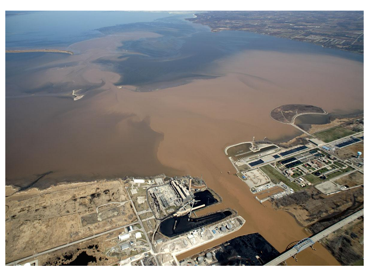
Photo of sediment plume at mouth of Fox River in April 2011. Lower Fox and Green Bay TMDL identify 63% of Sediment and 47 % of Phosphorus loading to Green Bay from Agriculture Sources.