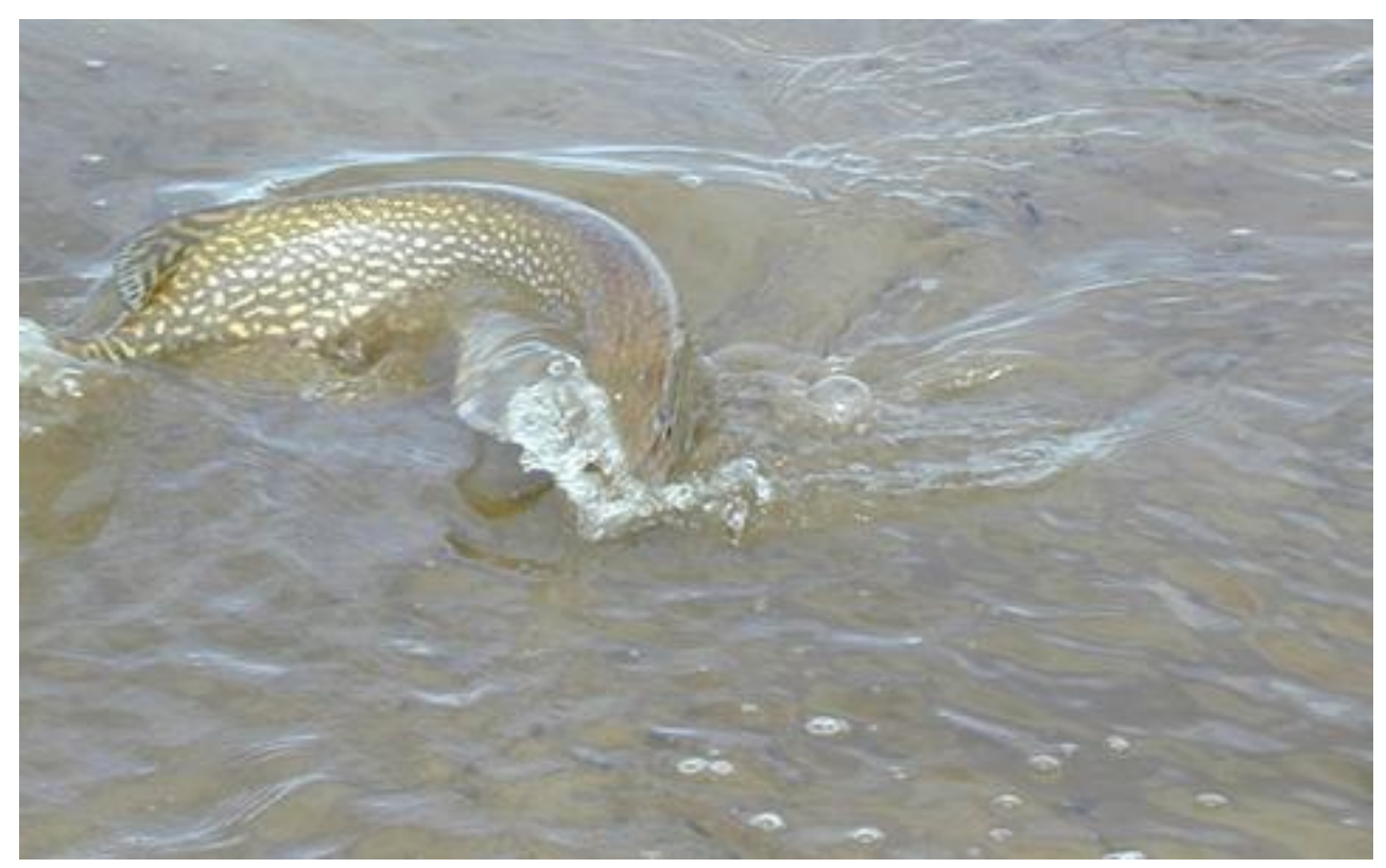
Spawning pike in West Shore project area