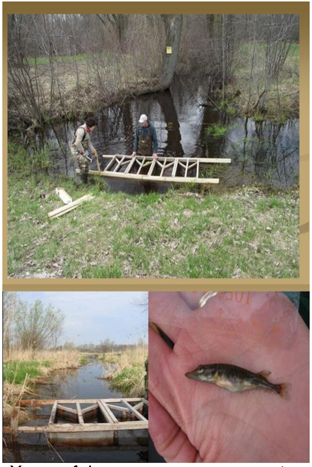
Young of the year assessment trapping