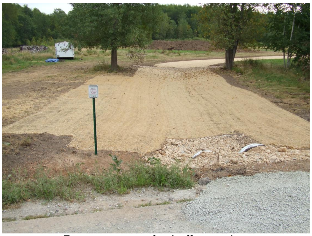
Erosion netting for buffer seeding