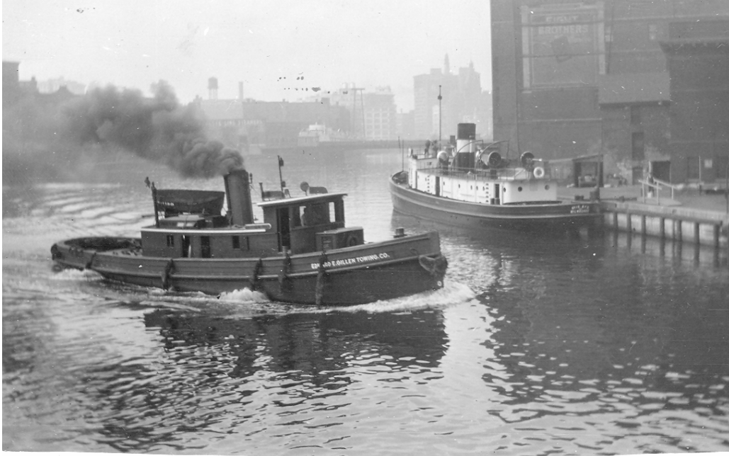
FIGURE 5. The tugboat Edward E. Gillen, 1932 (foreground;)