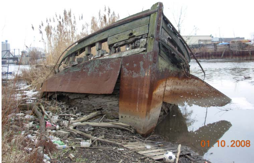
FIGURE 1. The wreck of the tugboat Edward E. Gillen, January 2008.

Following discussions with staff of the WHS about the desirability of obtaining a formal Determination of Eligibility for the wreck, an agreement was made to accept a brief narrative report describing the wreck in lieu of a formal DOE (C. Brown, WHS: personal communication).