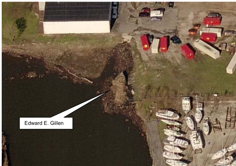
FIGURE 4. Aerial photo (close-up, from east) showing the wreck of the Edward E. Gillen, Summer 2007; note location below storm sewer outlet.