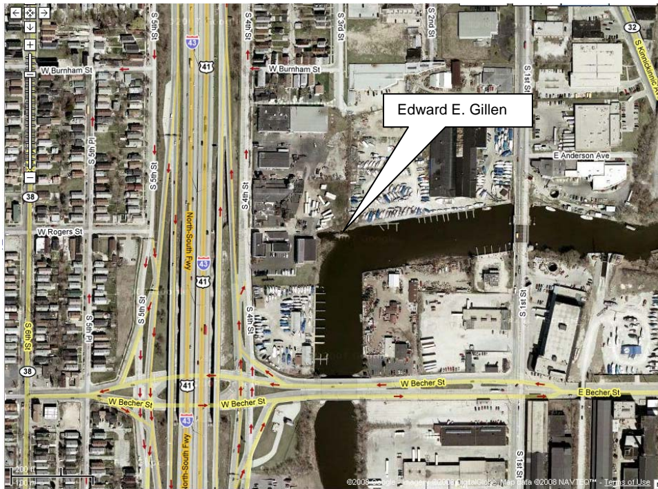
FIGURE 3. Location of the wreck of the tugboat Edward E. Gillen at a bend in the Kinnickinnic River within the City of Milwaukee (Google).