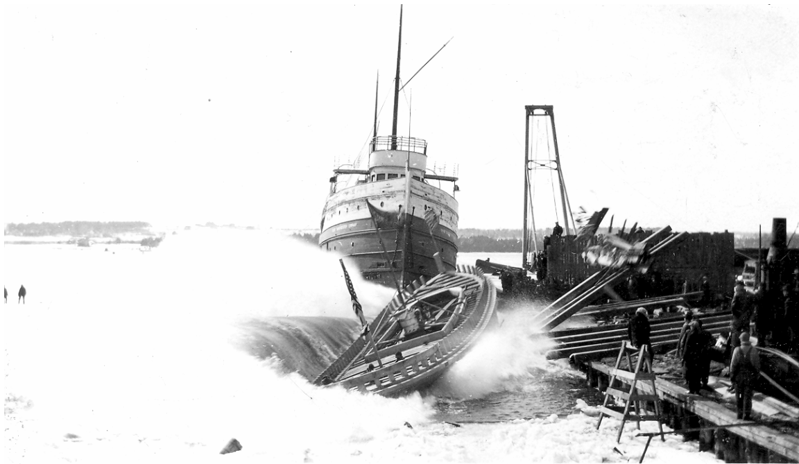
FIGURE 2. Launch of the tugboat Edward E. Gillen at Sturgeon Bay, WI, 1928.