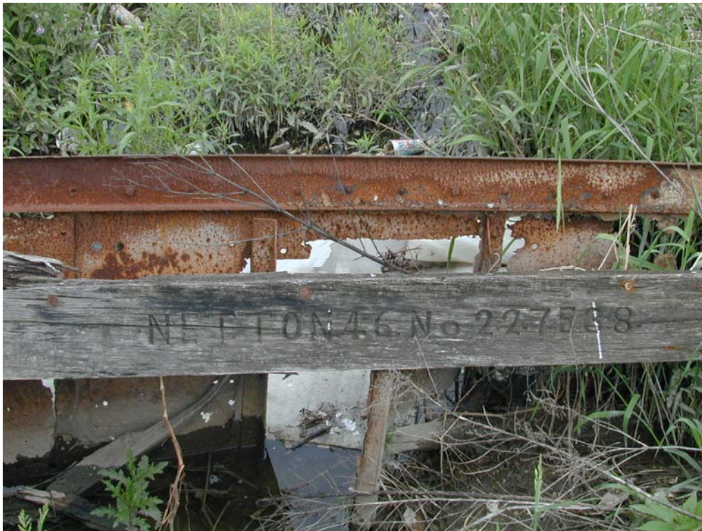
FIGURE 6. Edward E. Gillen ship registration number board (no.: 227538; WHS: n.d.).