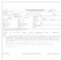
EdwEGillen (227538) data sheet.tif