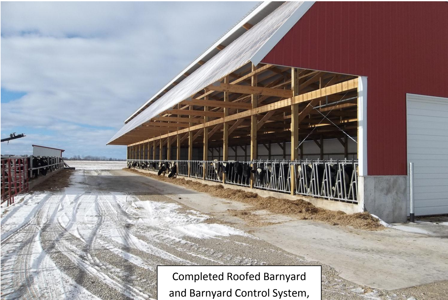
Completed Roofed Barnyard and Barnyard Control System, both are sloped to gravity flow into the manure storage facility.