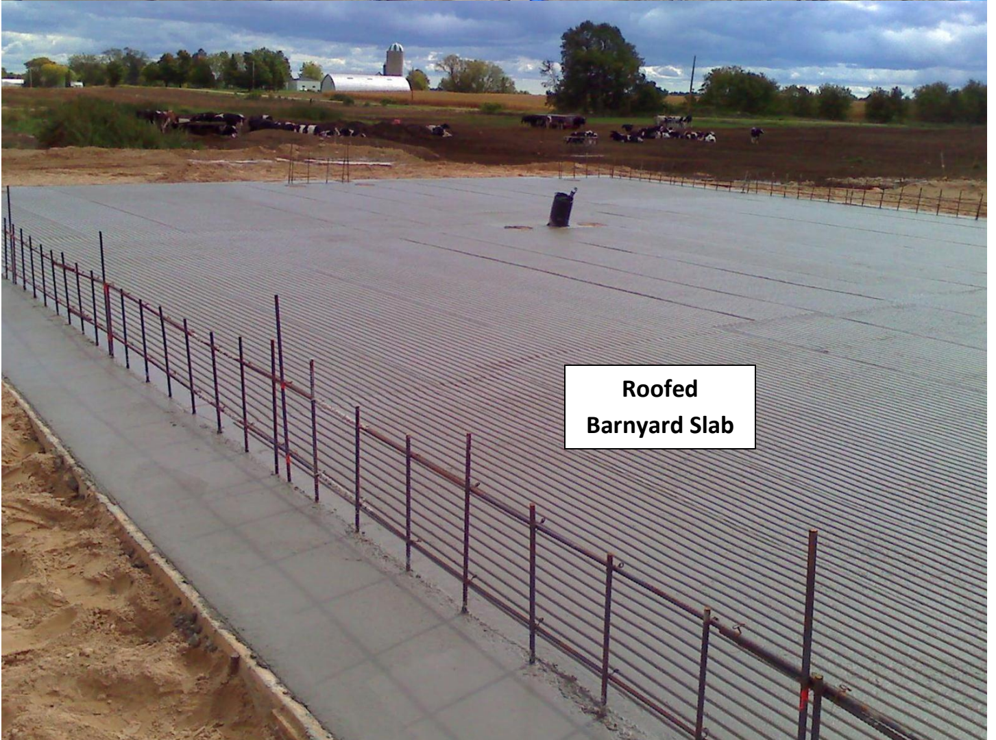
Roofed Barnyard Slab