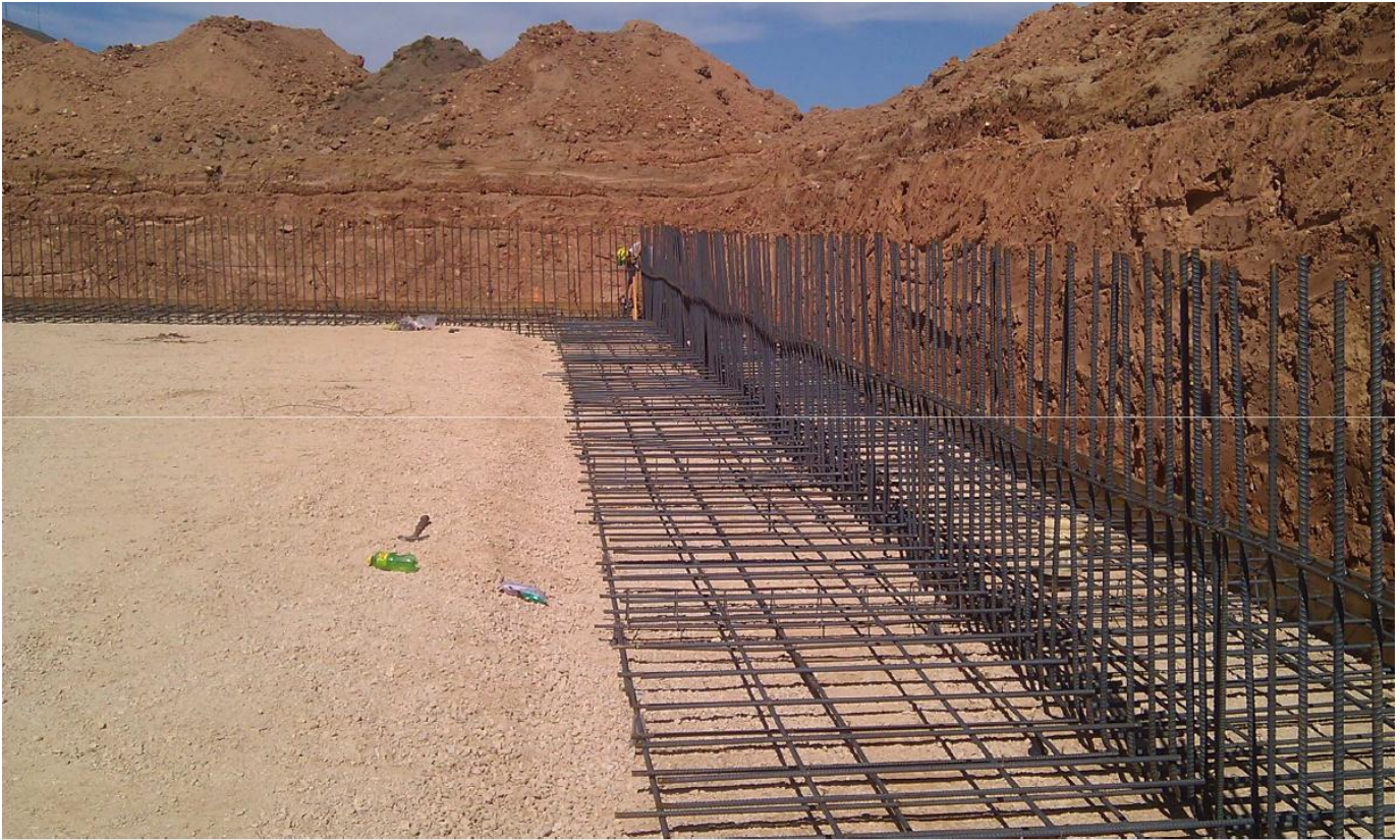
Construction of Long-Term Manure Storage