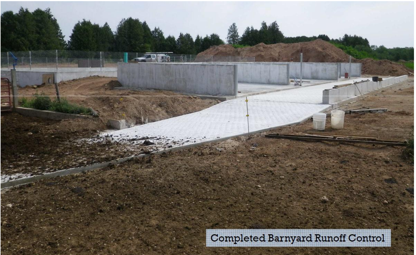
Completed Barnyard Runoff Control