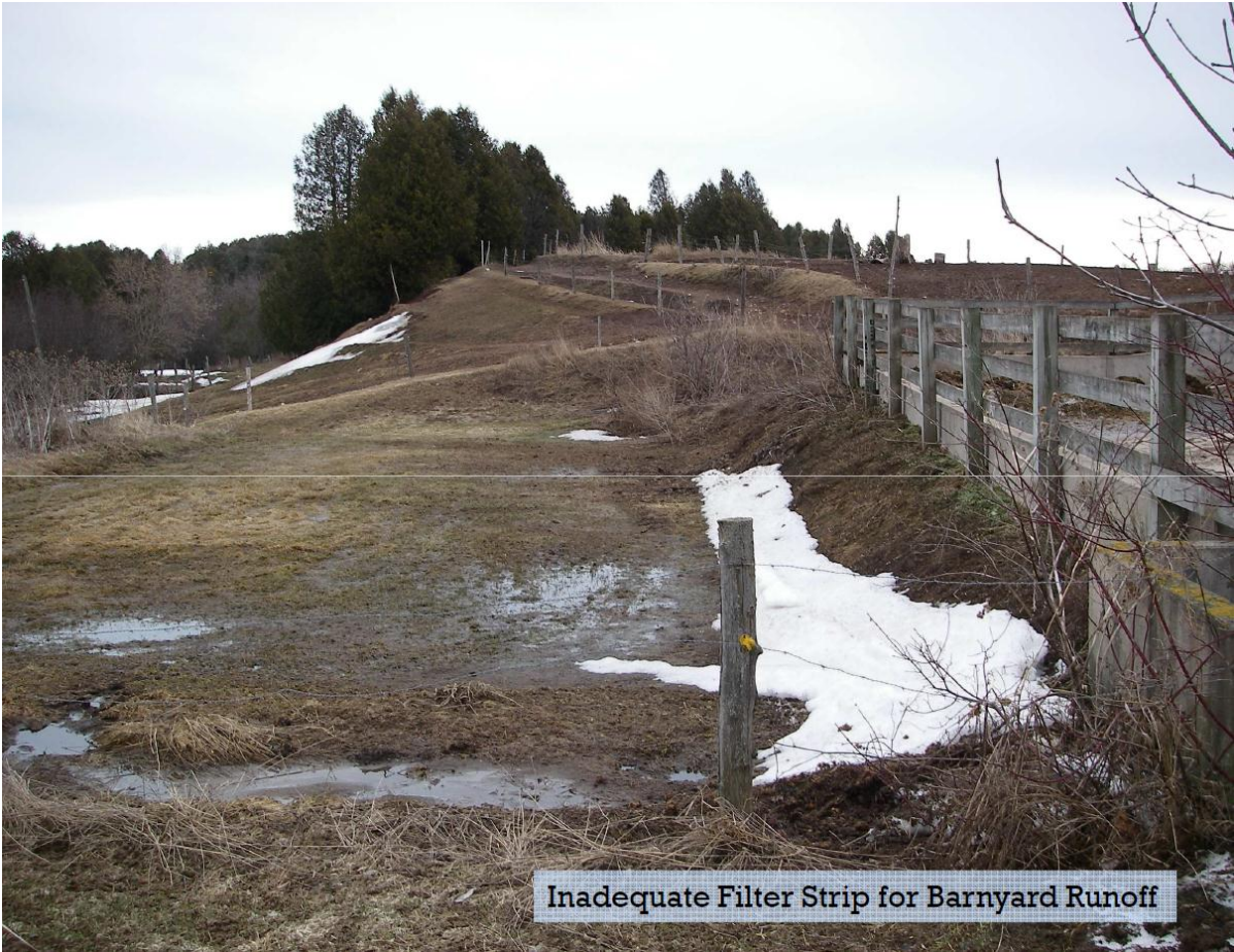
Inadequate Filter Strip for Barnyard Runoff