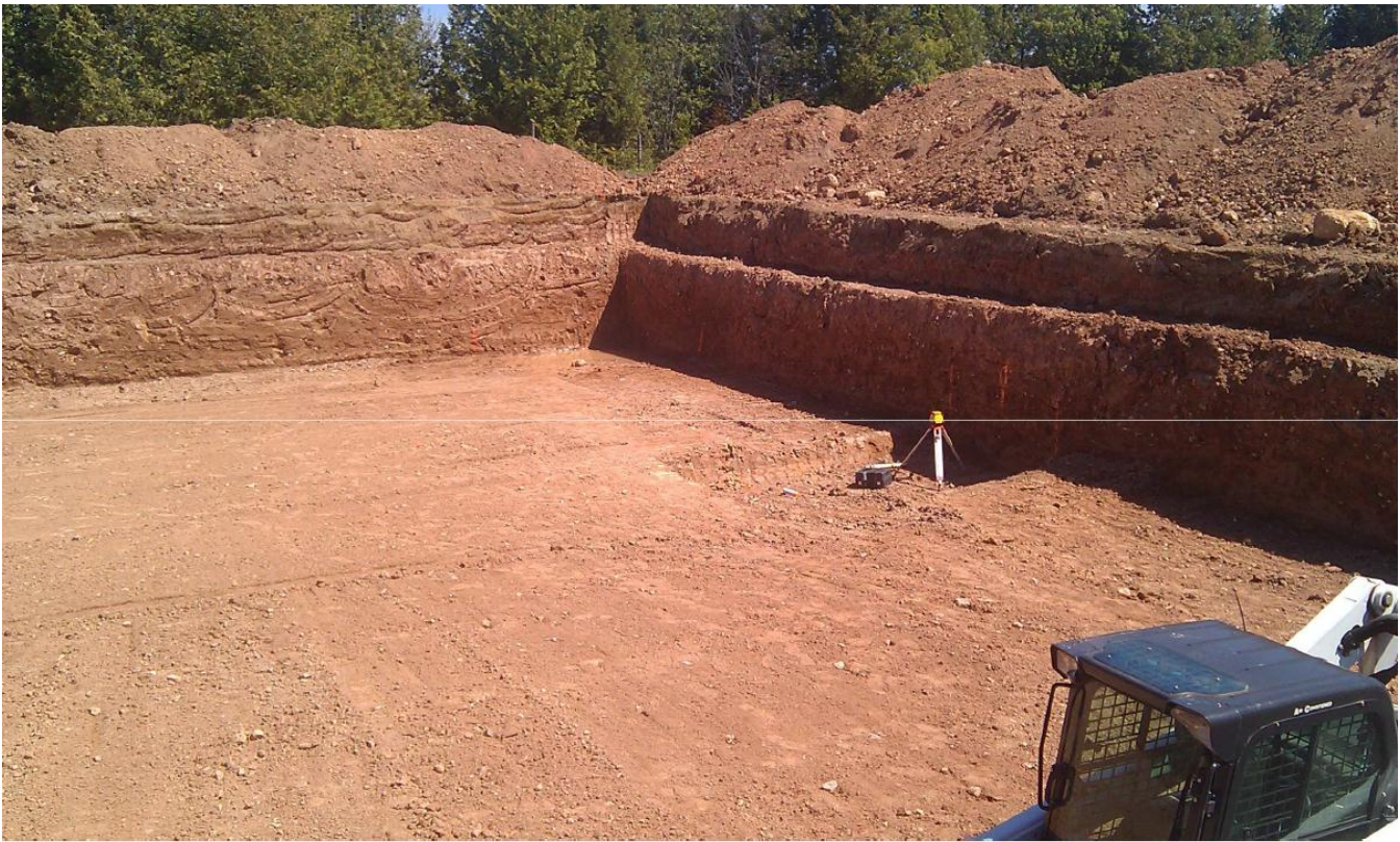
Construction of Long-Term Manure Storage