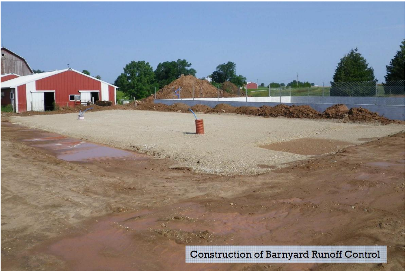
Construction of Barnyard Runoff Control