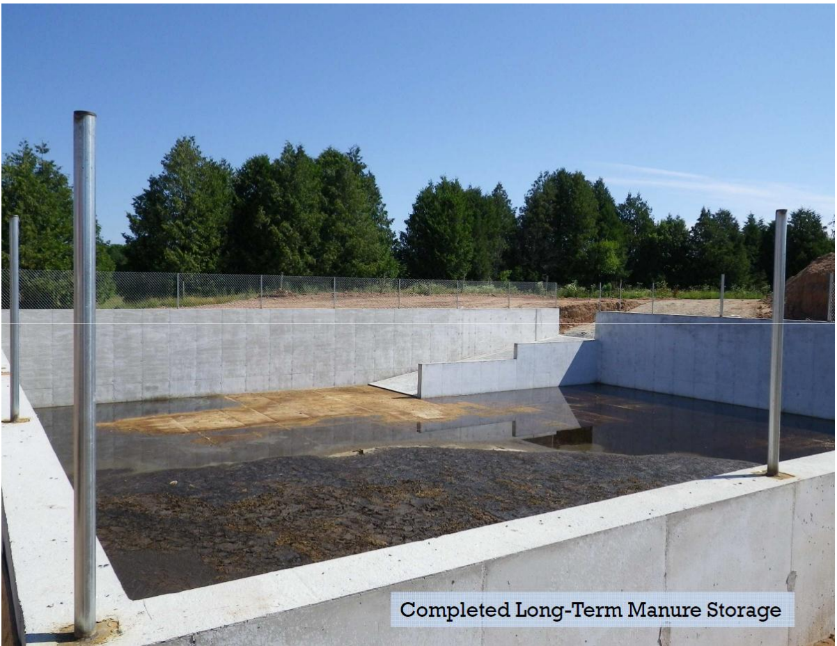
Completed Long-Term Manure Storage