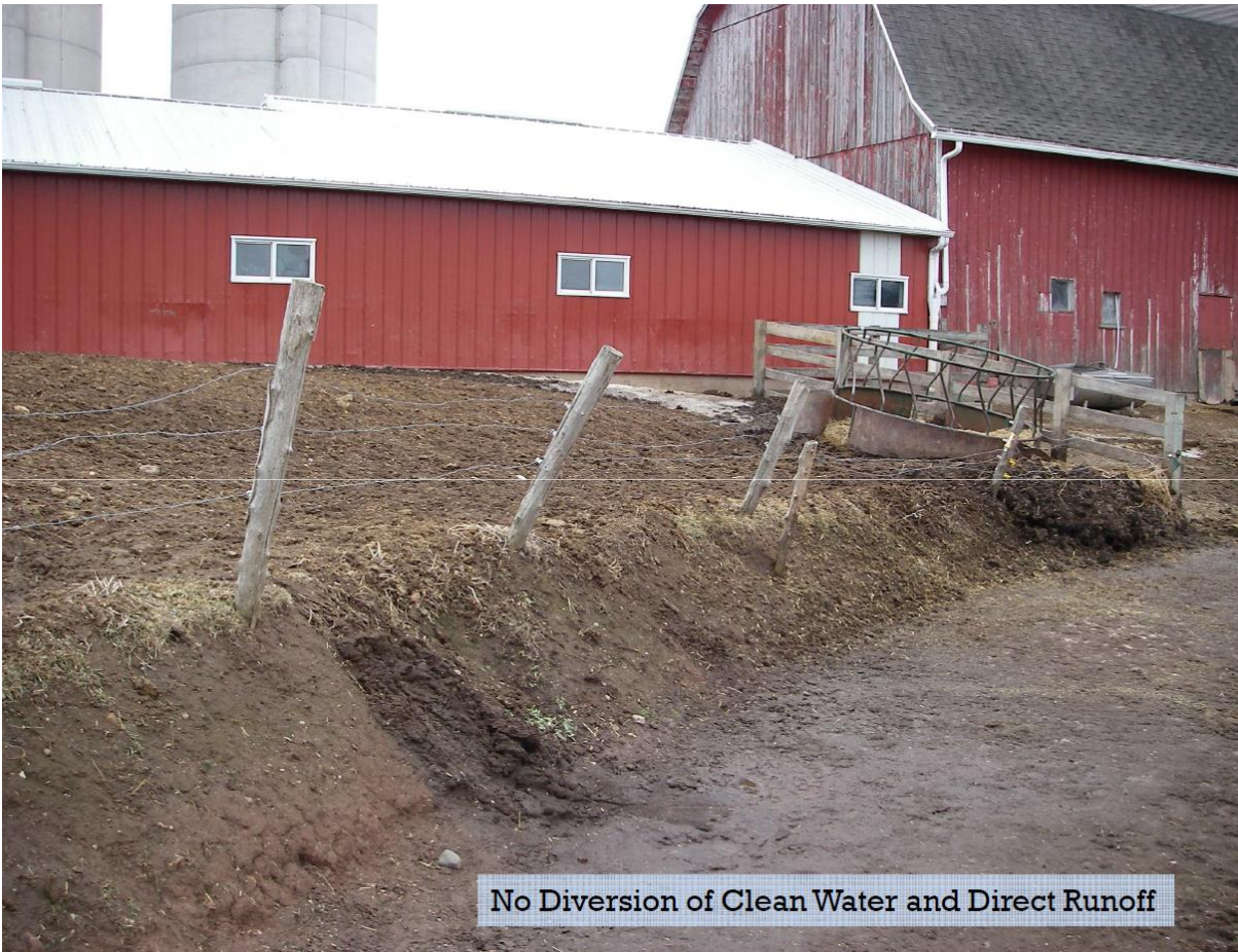
No Diversion of Clean Water and Direct Runoff