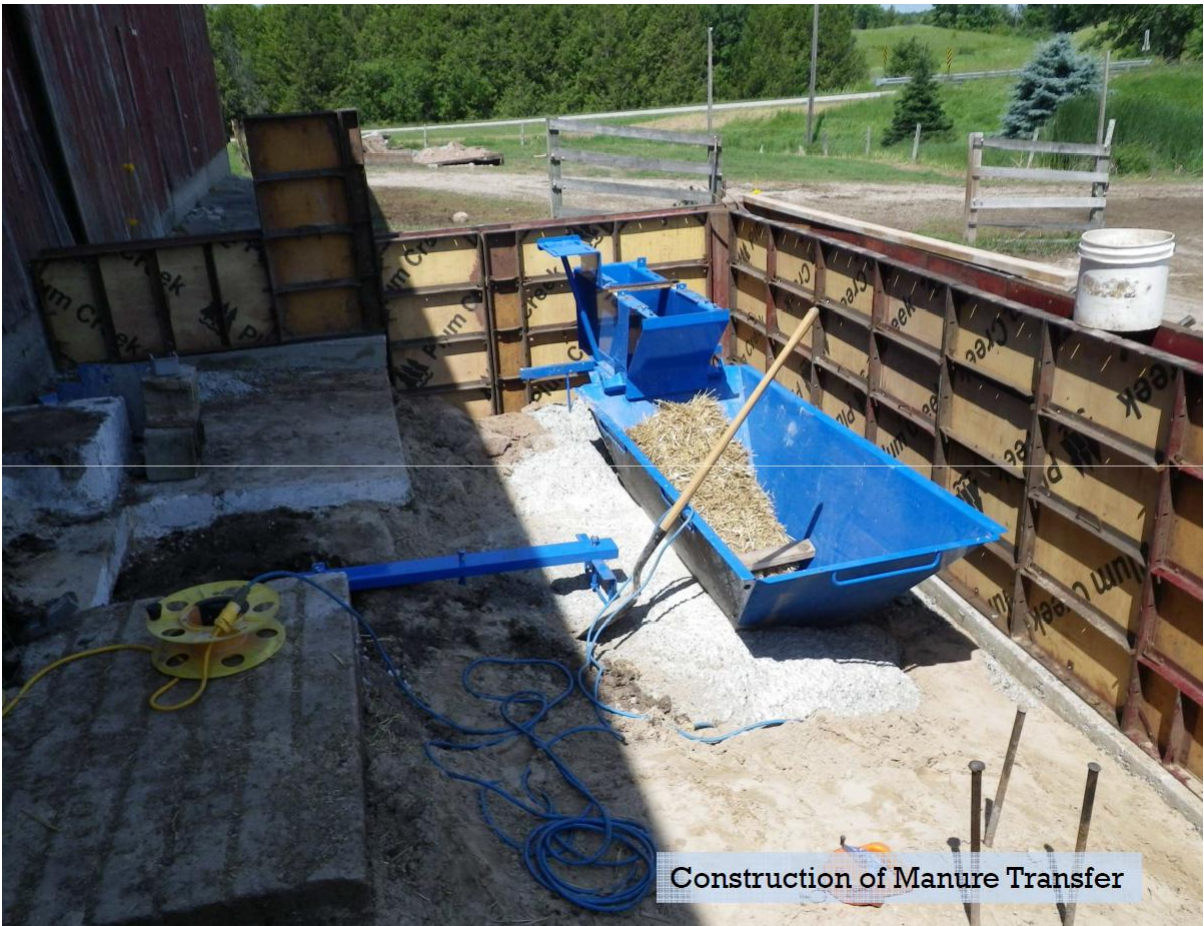
Construction of Manure Transfer