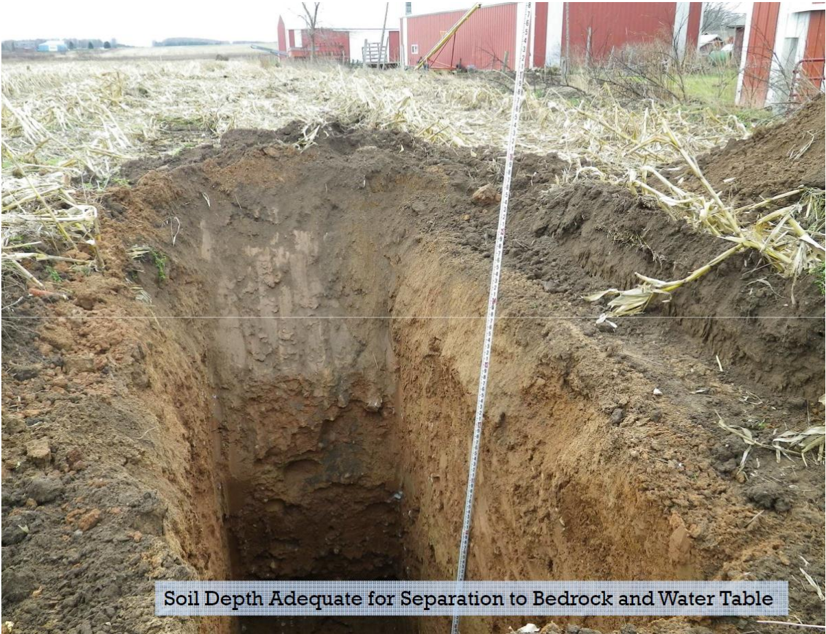
Soil Depth Adequate for Separation to Bedrock and Water Table