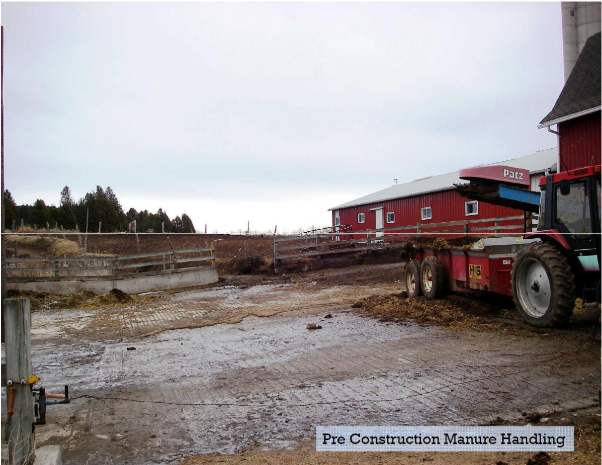
Pre Construction Manure Handling