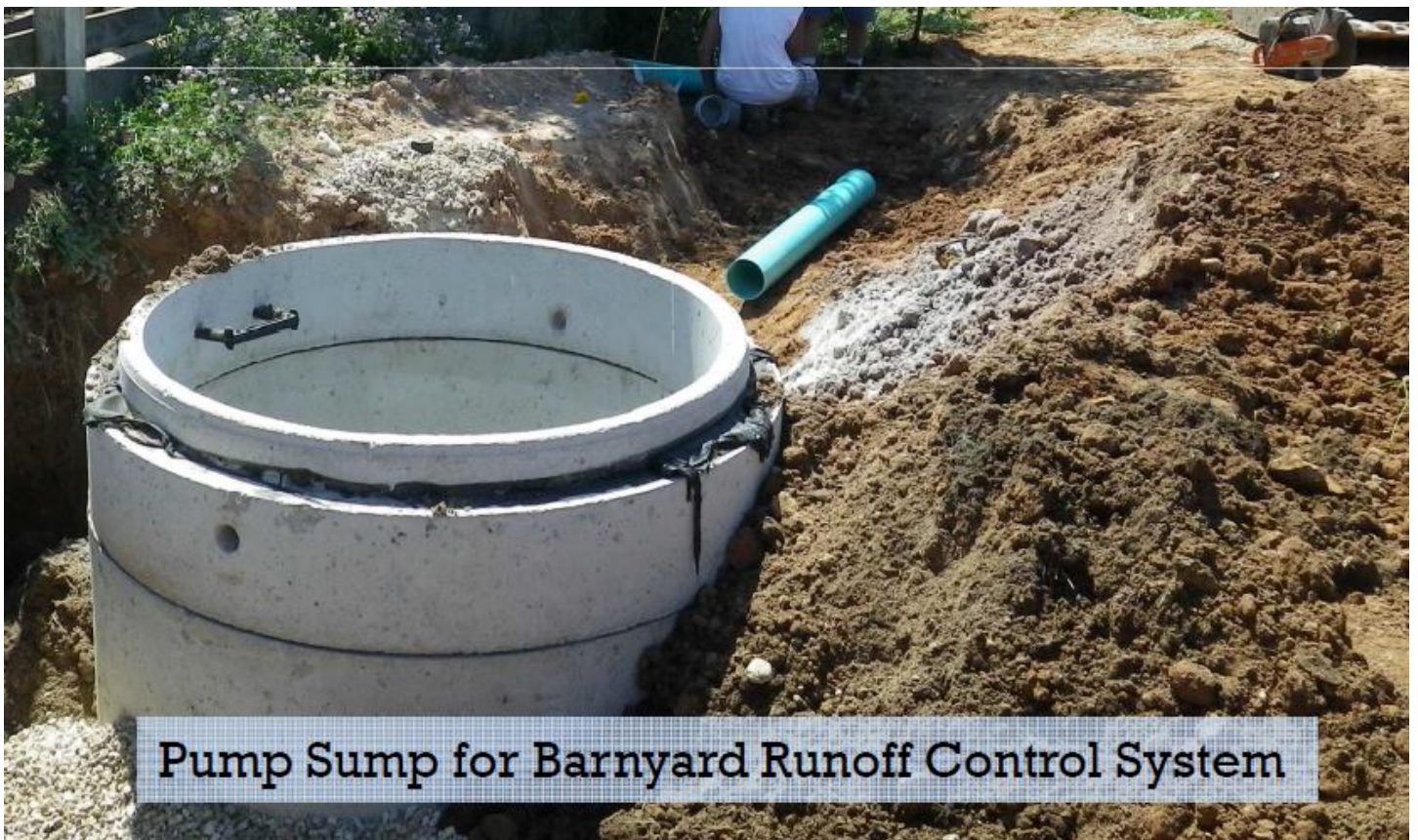
Pump Sump for Barnyard Runoff Control System