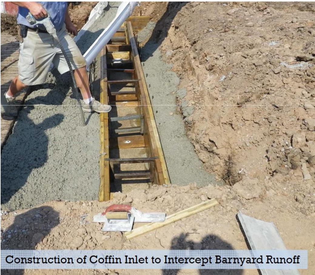
Construction of Coffin Inlet to Intercept Barnyard Runoff