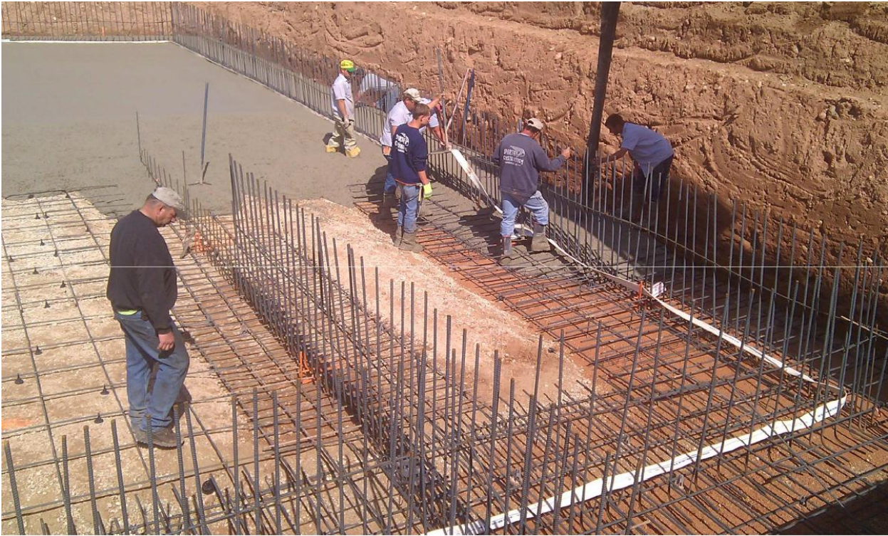
Construction of Long-Term Manure Storage