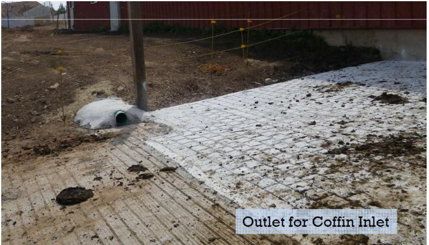
Outlet for Coffin Inlet