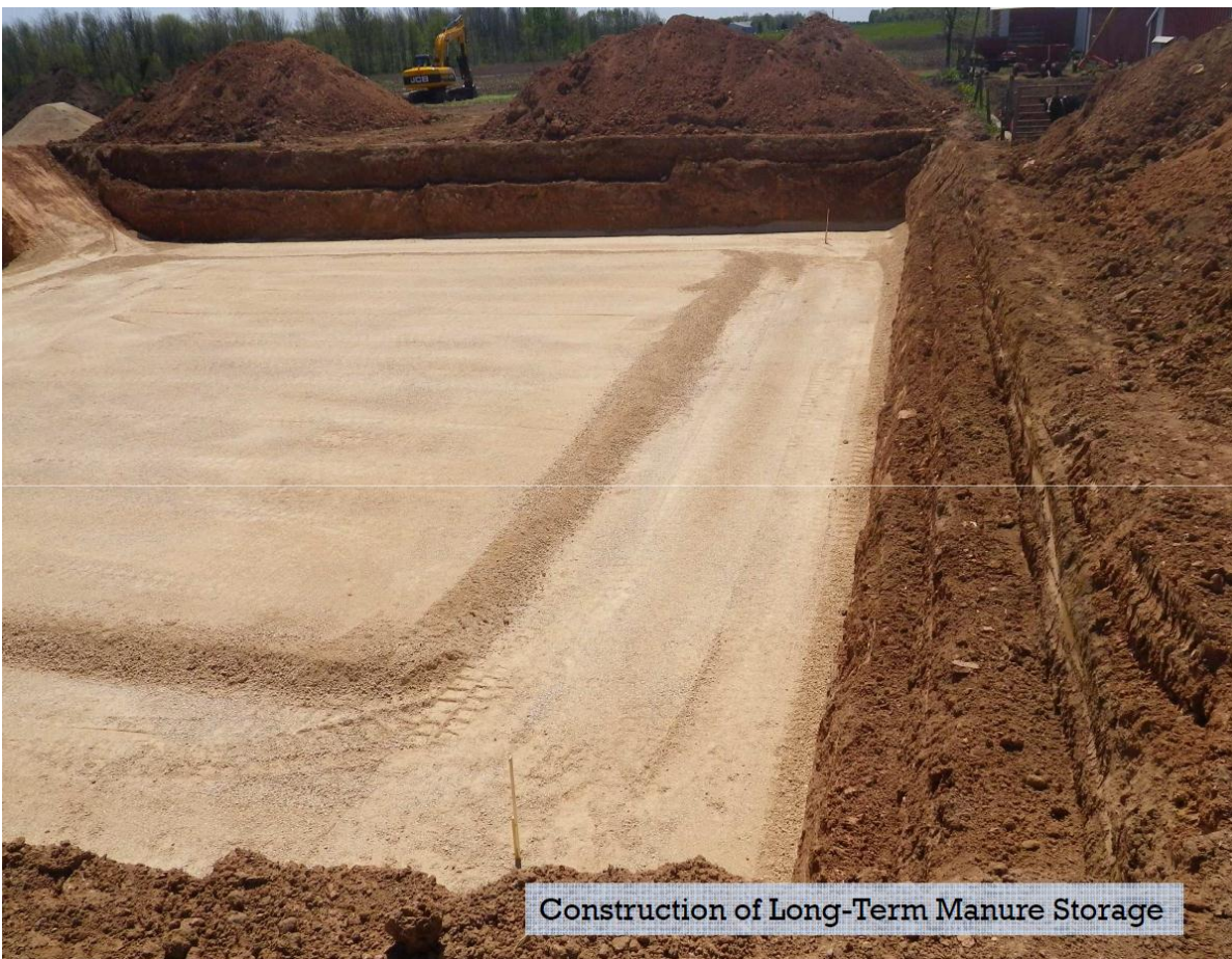
Construction of Long-Term Manure Storage