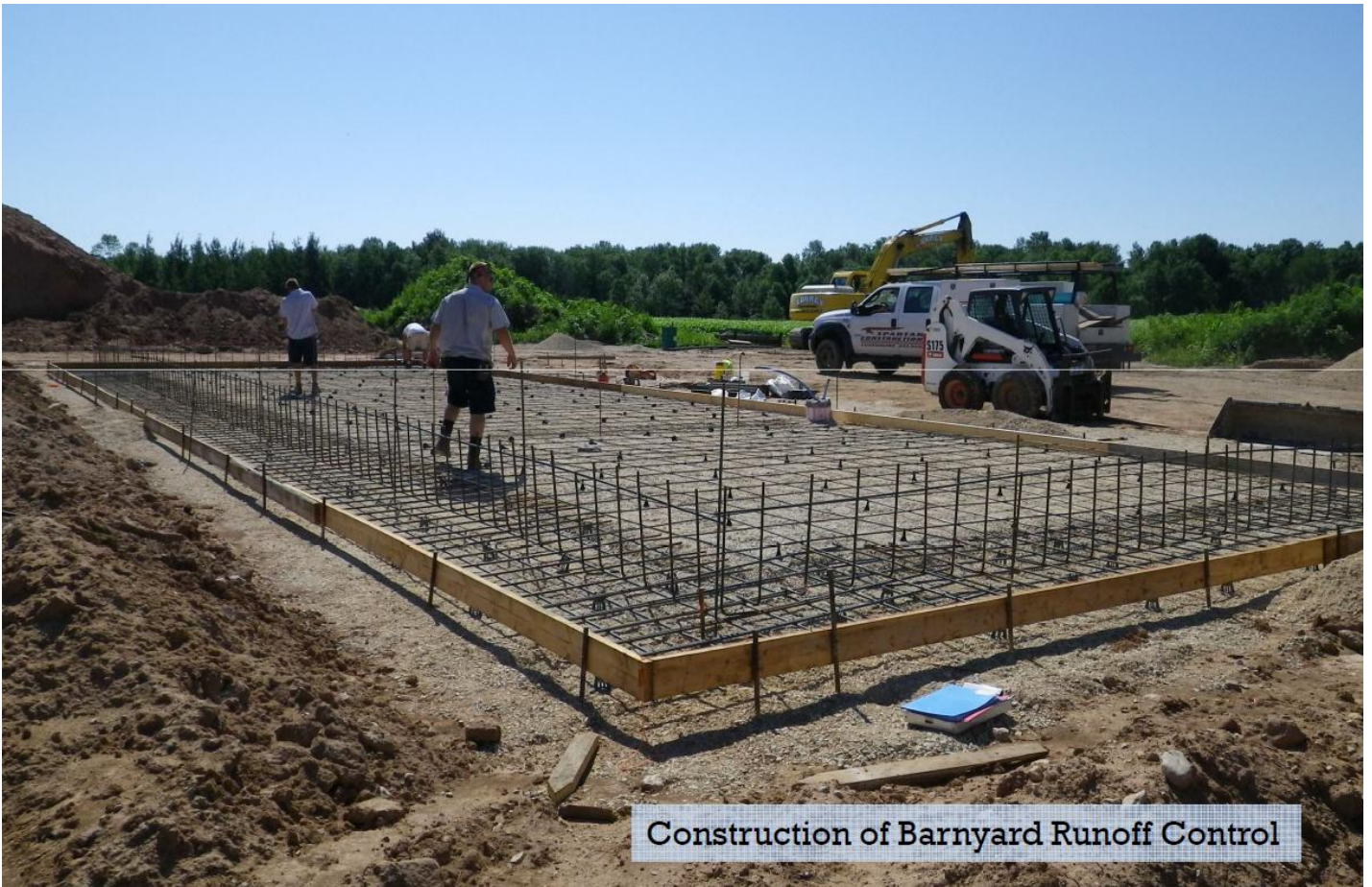
Construction of Barnyard Runoff Control