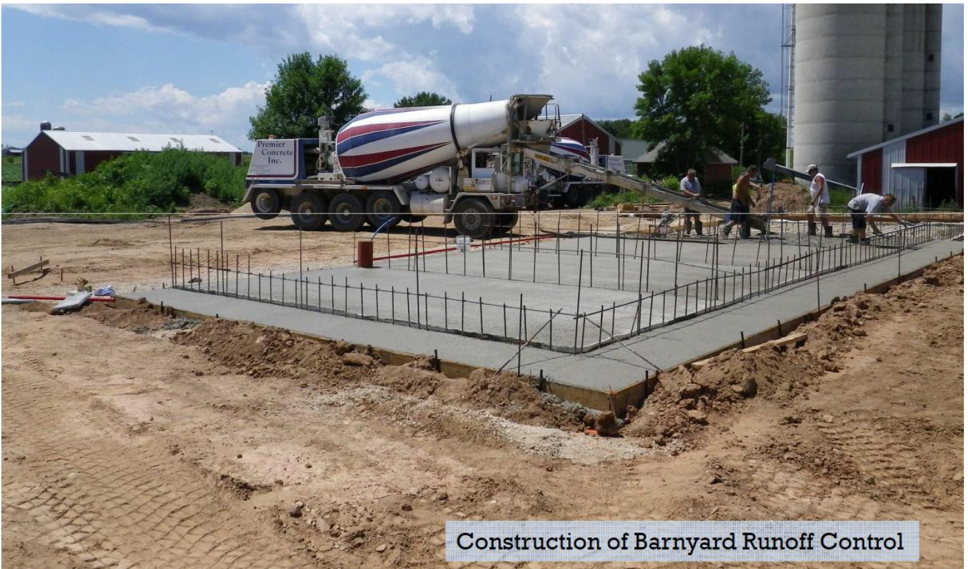
Construction of Barnyard Runoff Control