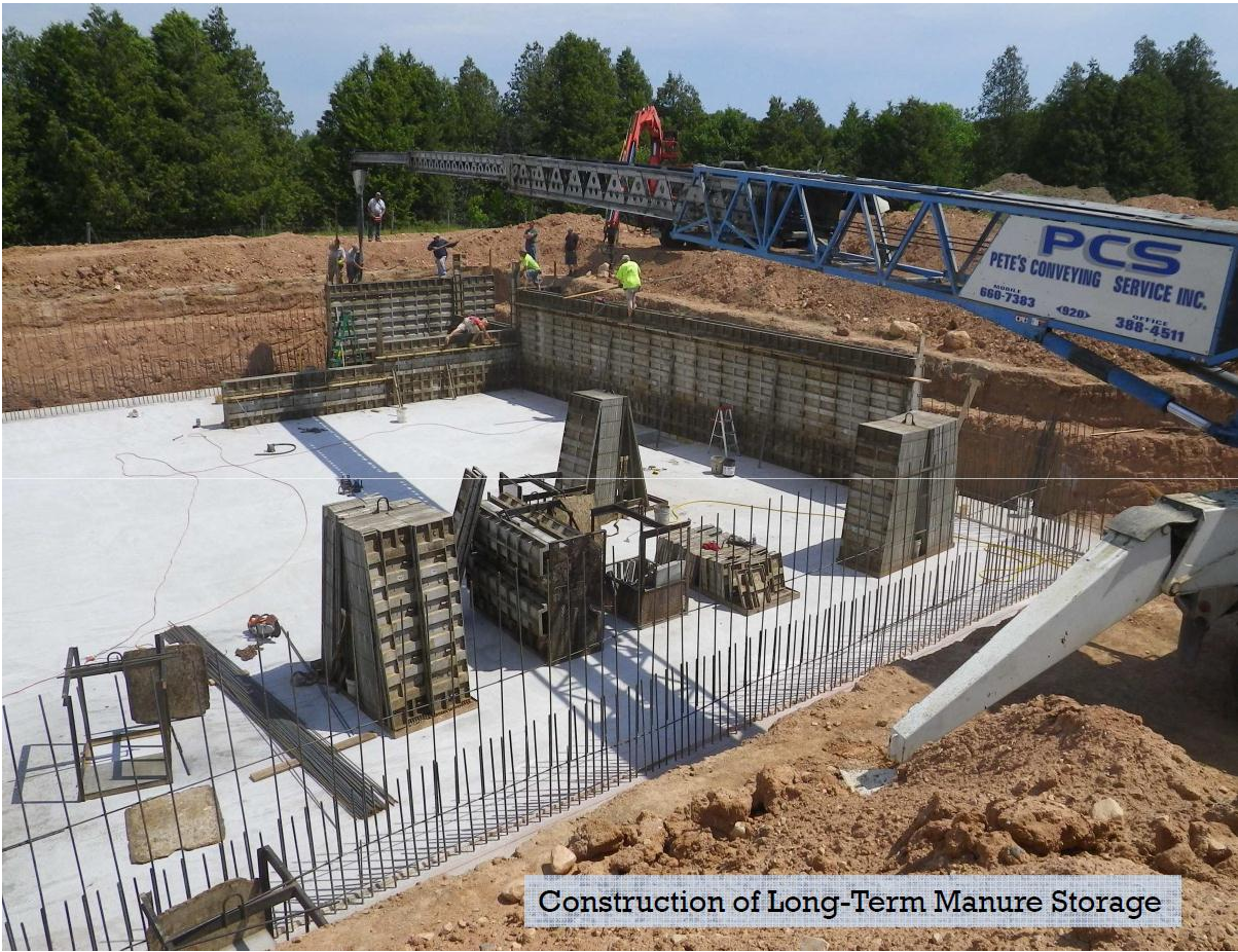
Construction of Long-Term Manure Storage