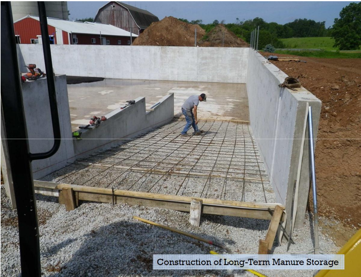
Construction of Long-Term Manure Storage