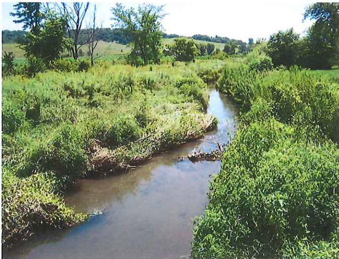
July 29, 2011