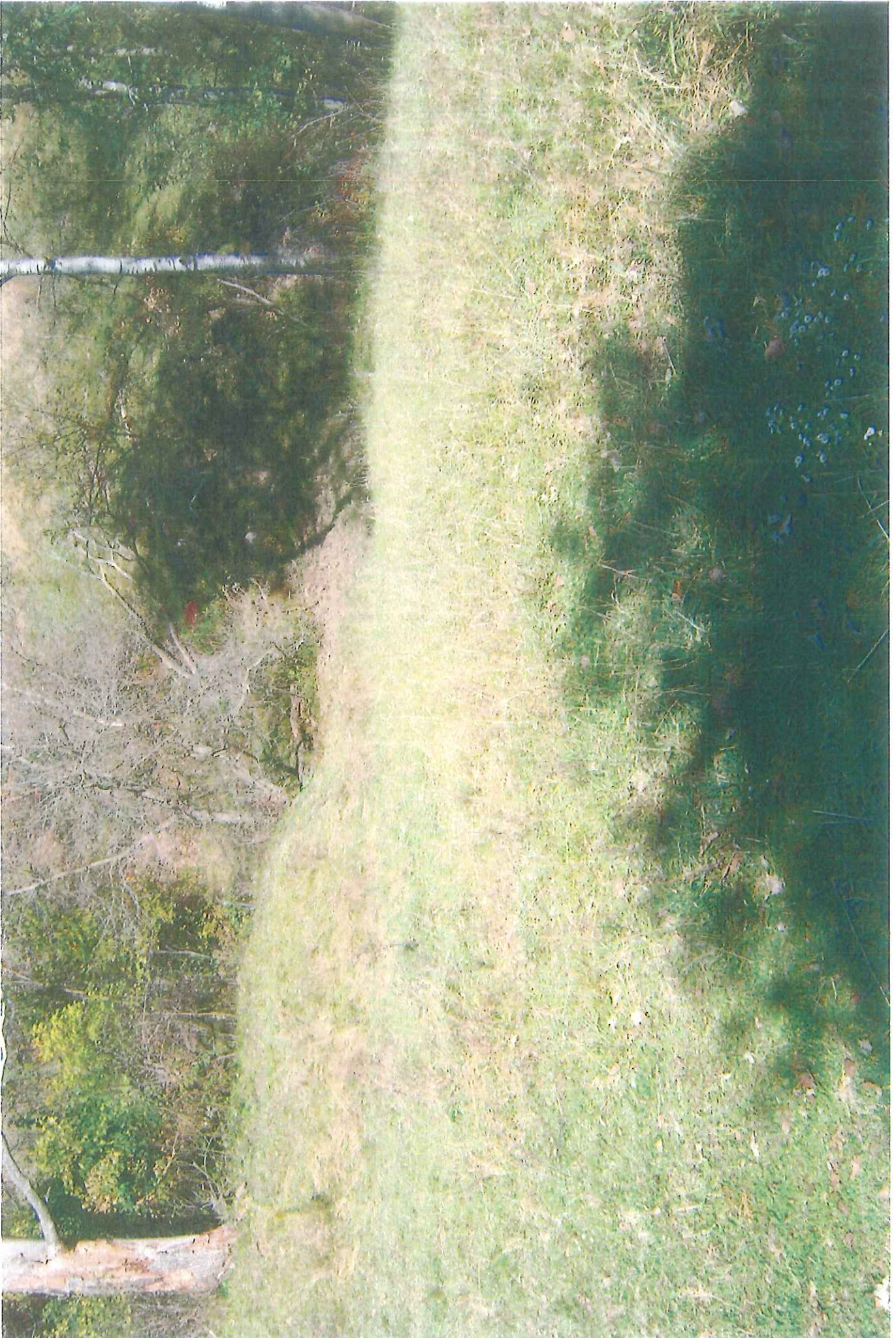
Dan Byom Critical Area (After)