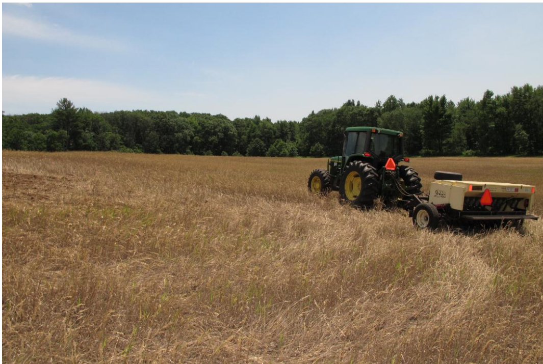
Figure 2. White River Wildlife Area. Seeding dry prairie with wildland drill. Invasive grasses were killed with herbicides prior to seeding.