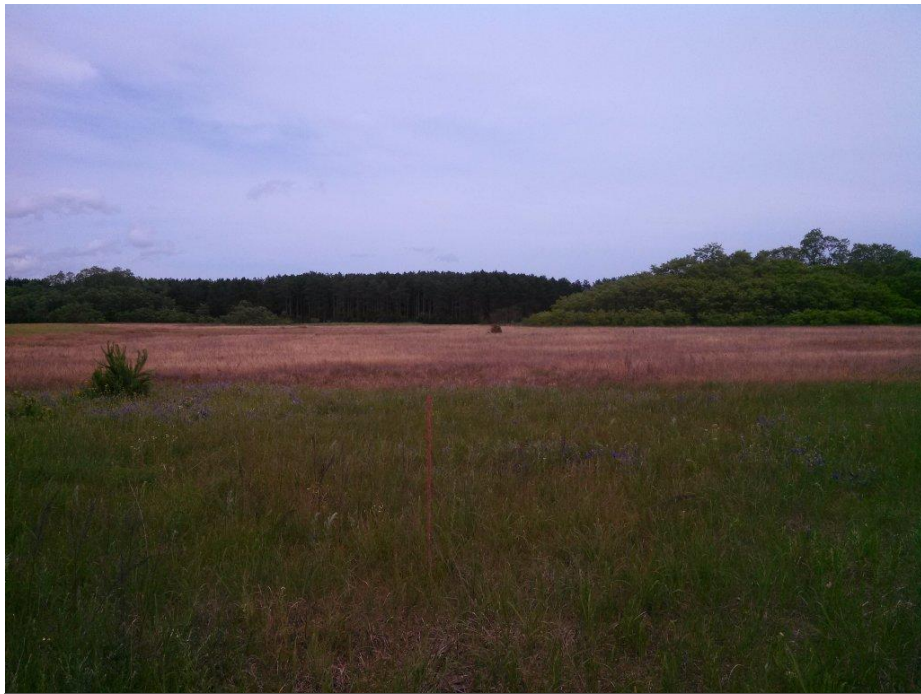
Figure 5. Herbicide treatment of invasive grasses on Hartman Creek State Park as site preparation for dry prairie seeding. Foreground is private land and not treated.