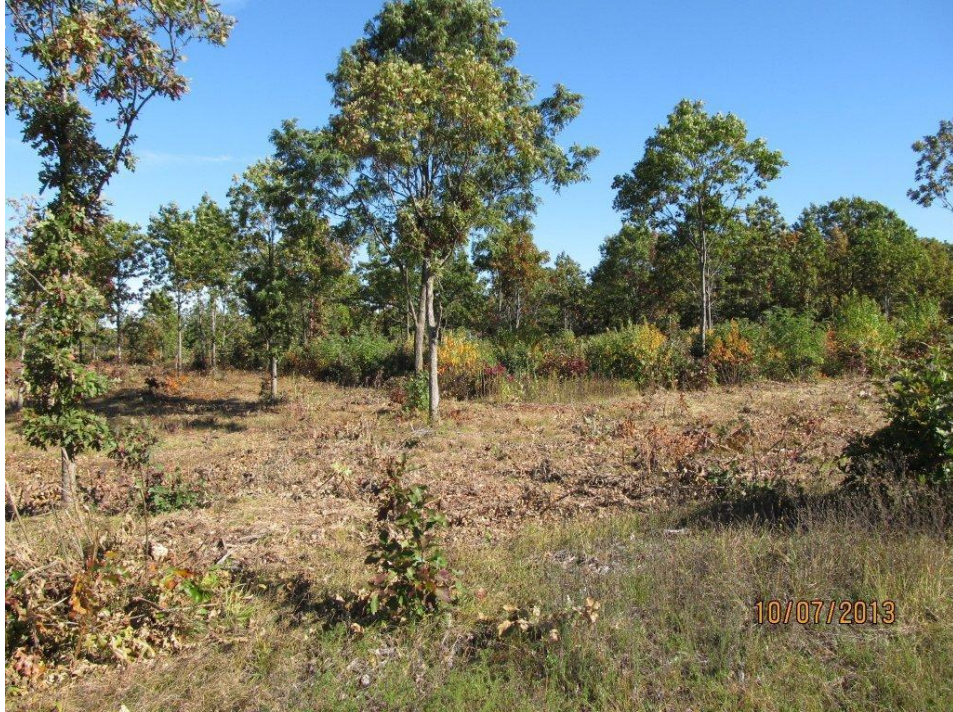
Figure 4. Brush mowing completed on Greenwood Wildlife Area. Note brushy understory (unmowed) in background illustrating pre and post management conditions.