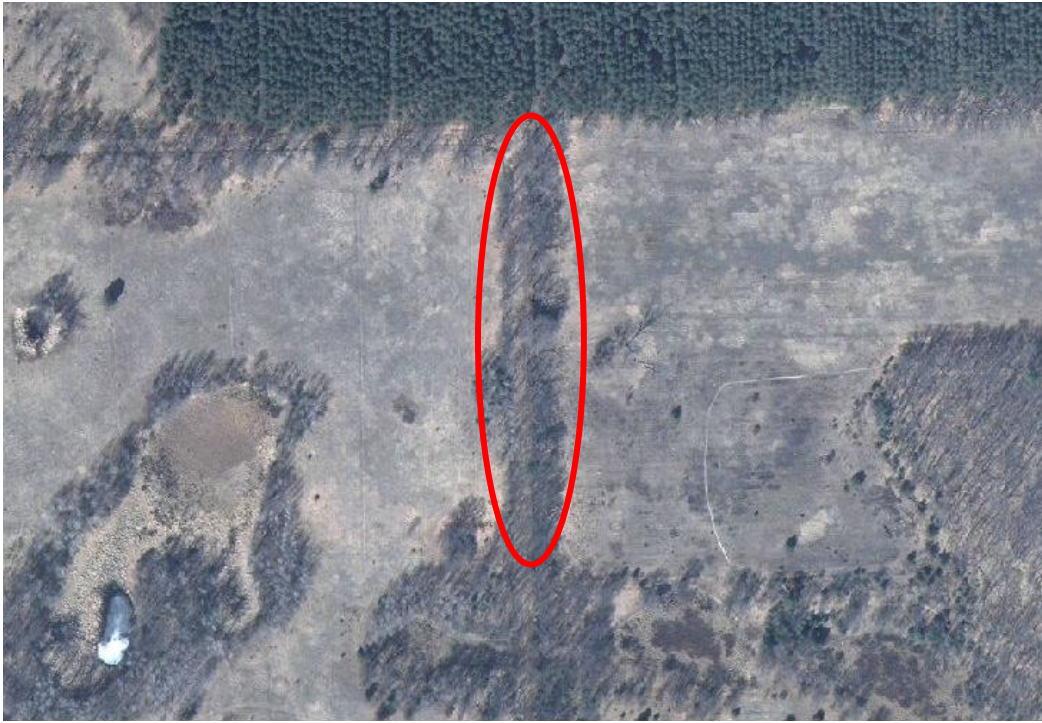
Figure 1. Hartman Creek State Park. Site map of canopy/brush removal to allow Karner butterfly movement between field segments.