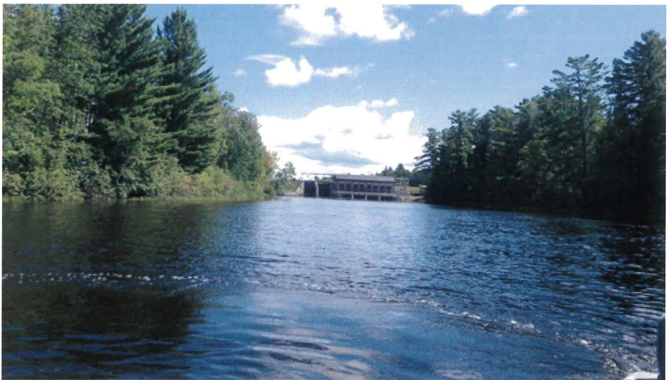
PXLY 2013 Purple loosestrife survey day