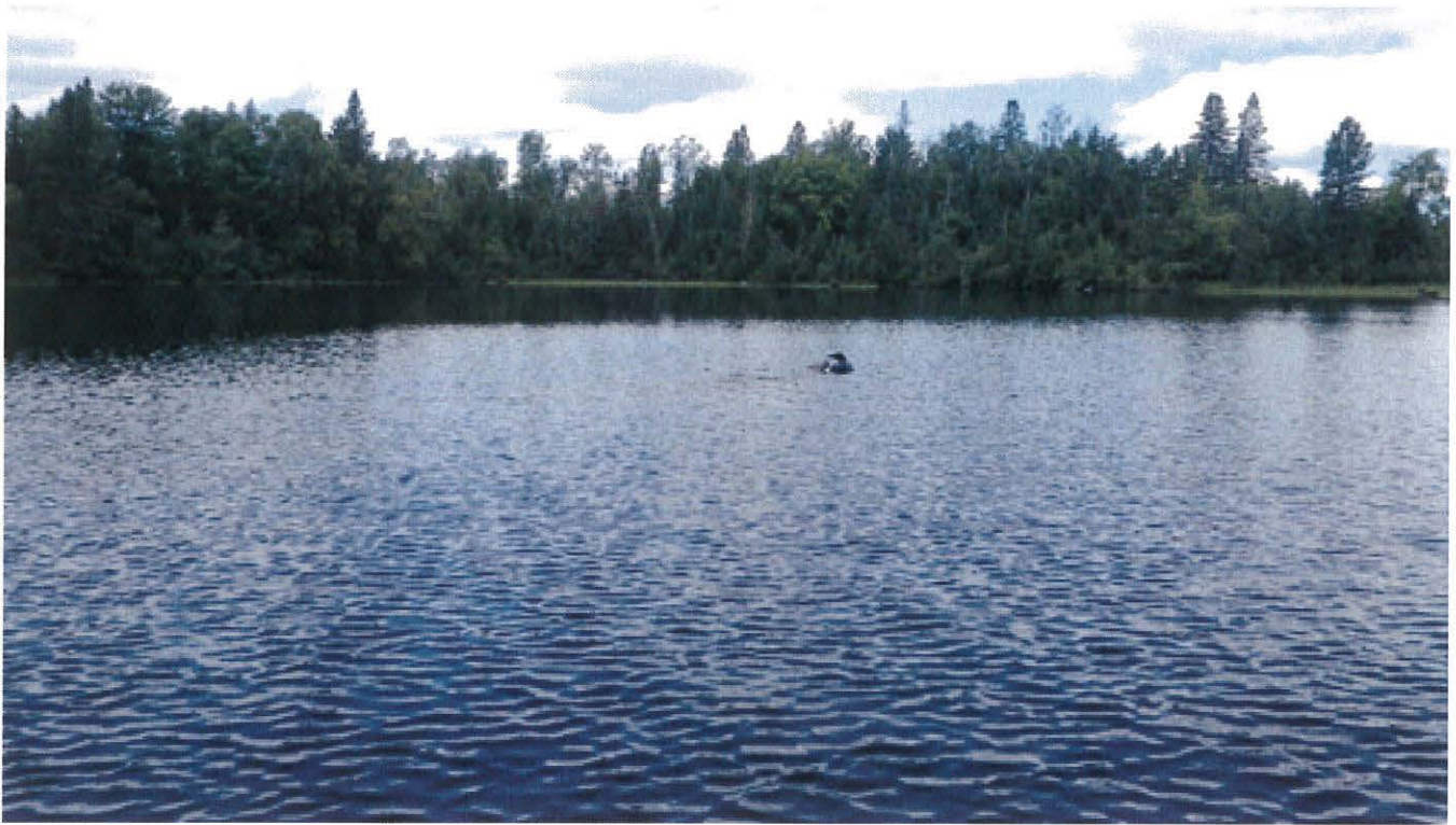
PXLY Loon and chick 2013