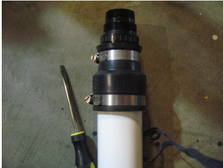
Assemble integrated sampler with a flathead screw driver.