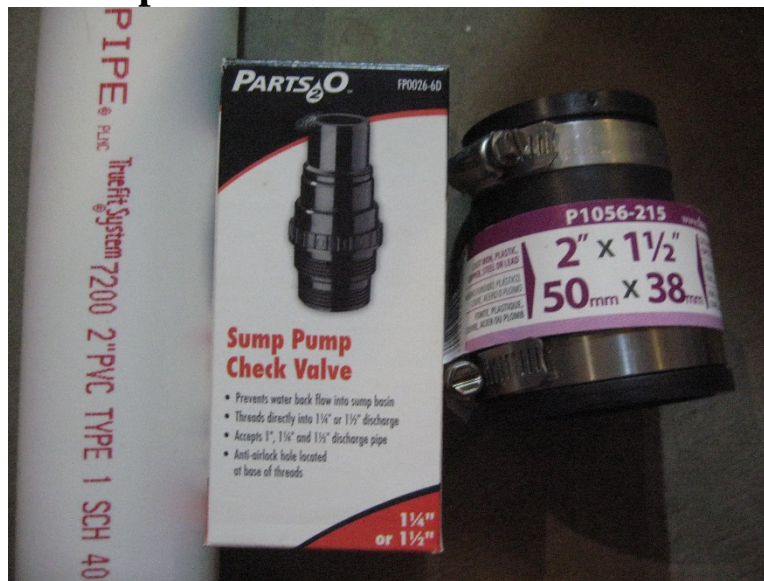
Integrated sampler requirements, 2"Pvc pipe, sump pump check valve, and 2"x 1 1/2"couping